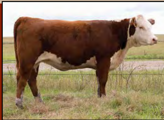
SYDNEY 7X 5A