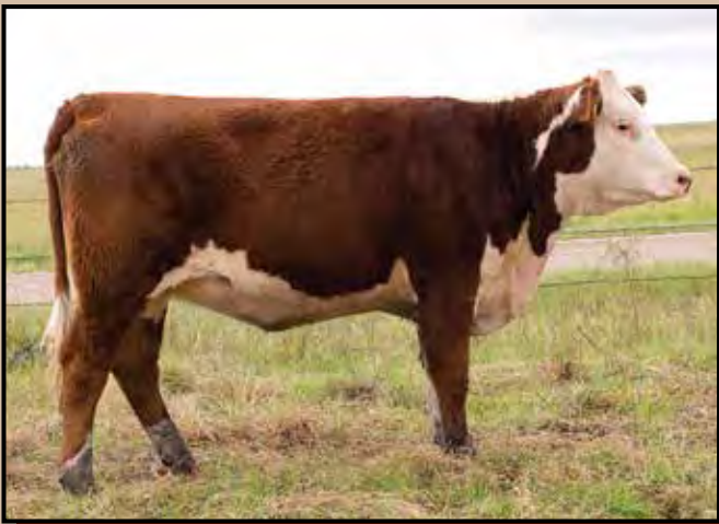
SYDNEY 7X 61A

Pasture exposed to Haroldson's JVJ Covert 425X 8A from May 21 to June 24, 2014. Observed bred May 25. Preg. checked safe.