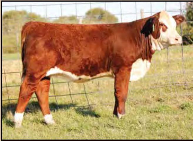
SARAH 41Y 29B

Rythm is a female that will really catch your eye with her great looks. She is a short marked female that is beautiful through her front end. She has ample muscle and I really like the shape and spring to her rib. This is another great example of how Liner worked on these first calvers. Her dam, 21Z is a short marked, beautiful uddered Tahoe two year old. Don't miss this one.