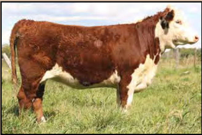
Addy 35W 23A

Exposed to ANL 521X Victor 65U 23Z from May 17 to August 10, 2014. Preg checked safe 90 days on August 22.