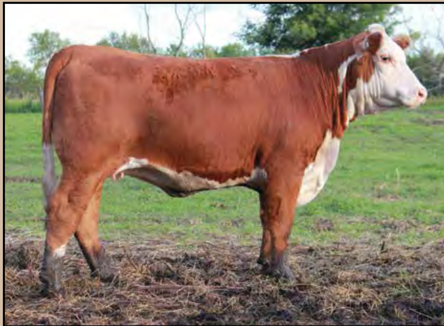
THE CHIVE 28A

Bred to Square-D Plainsman 946Y on May 3, 2014; exposed to him from May 18 to August 15, 2014. Projected calving date is February 11, 2015.