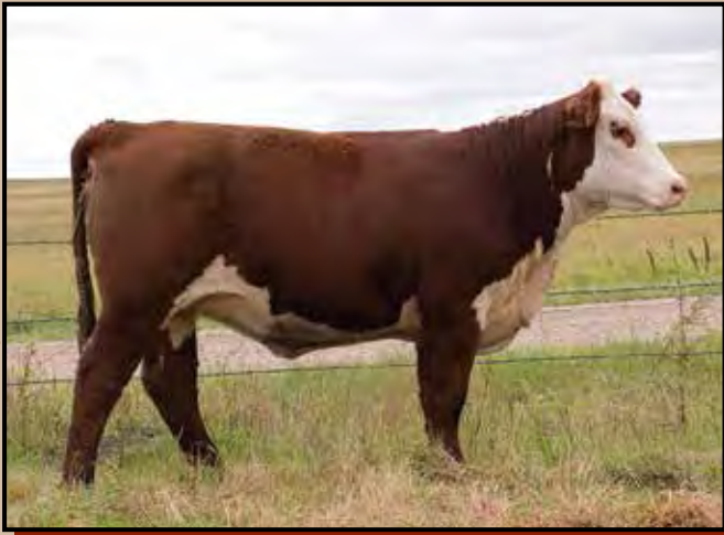
PAYTON 10W 15A