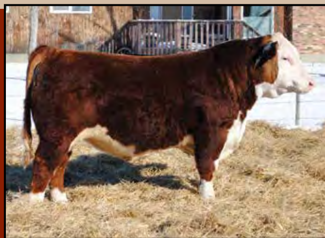
Victor 652U 23Z