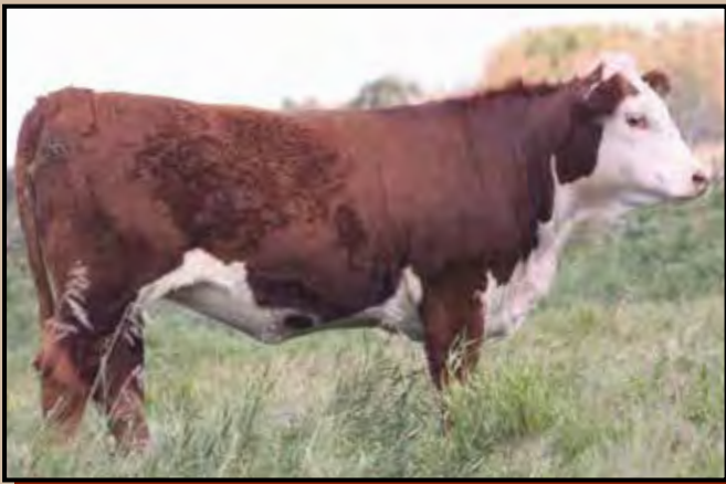
ANITA 36S 51A

Exposed to ANL 521X Victor 65U 23Z from May 17 to August 10, 2014. Preg checked safe 80 days on August 22.