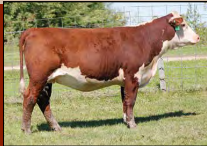
DEMI 92Y 2A

Exposed to Haroldson's WLC Reno ET 15W from June 1 to August 1, 2014.