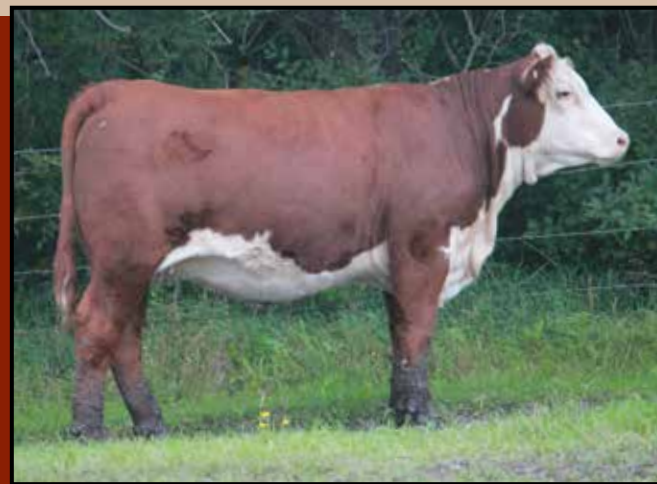
WAR QUEEN 230A