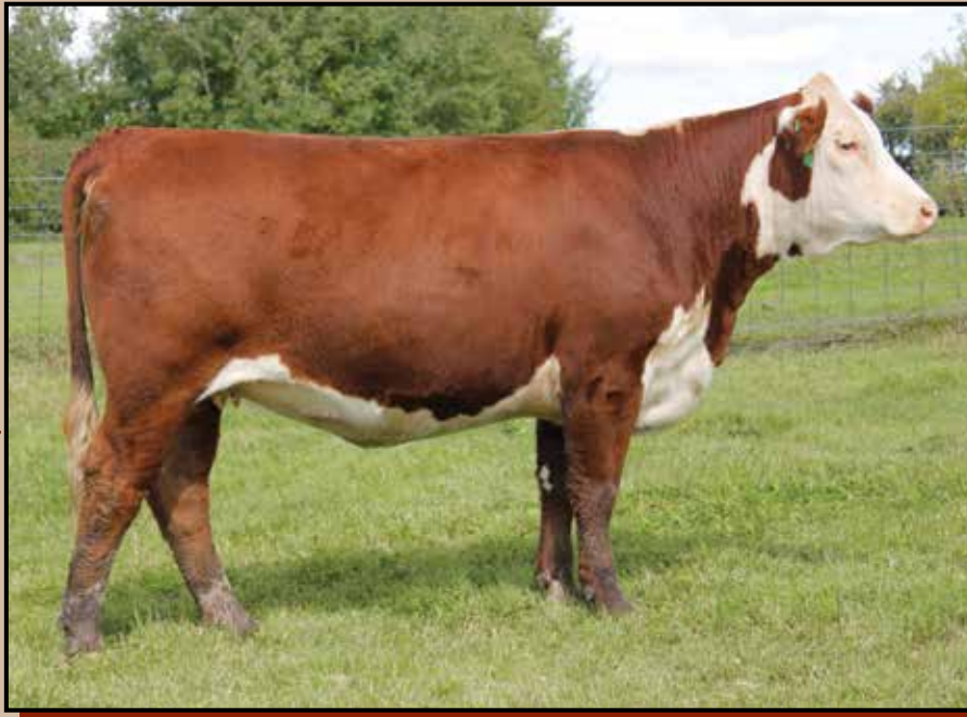
Lady T100 6A