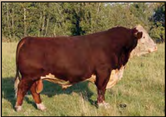
Tahoe R117 T100