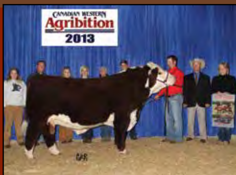
Haroldson's Young Gun 4T 92Y Reserve Grand Champion Bull Owned with Beck-Powell