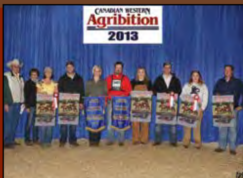
Haroldson's Polled Herefords Canadian Western Agribition Premier Breeder & Exhibitor Three years in a row!