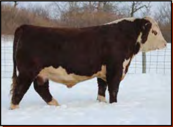
Young Gun 4T 92Y

Service sire of lots 58, 59, 60, 61, 62, 63, 64, 65, 66, 67, 68, 69 & 70