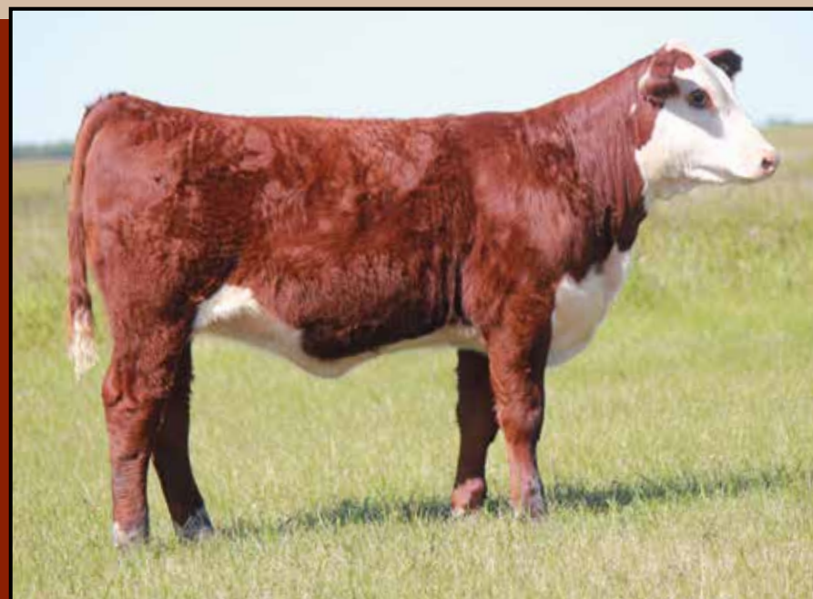
MERRY MELODY 224B