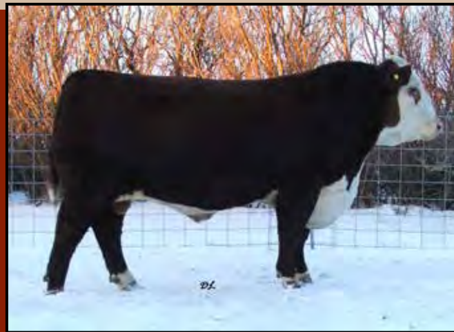
CONNECTED 13K 86R