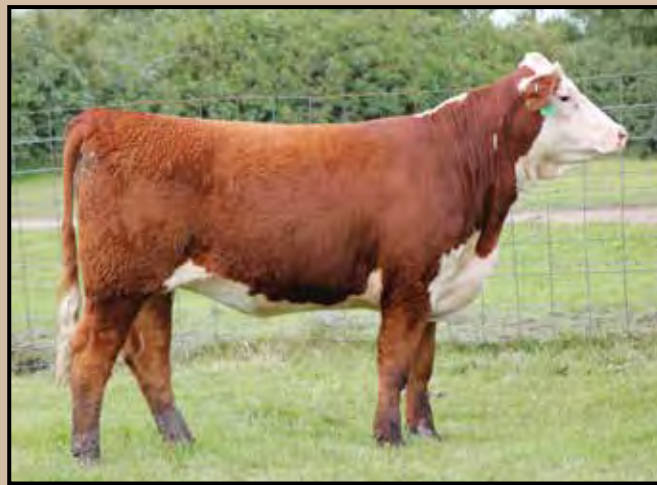
ARIEL 41Y 48A

LOT 67 HAROLDSONS Ariel 41Y 48A FEMALE PC02981994 AFSY 48A MAR 12, 2013