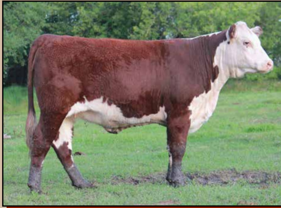
PROM DAZE 4A