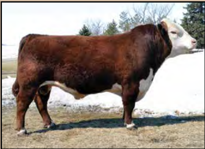
CROWLINE 4T 7X

REF HAROLDSON'S WS Crowline 4T 7X DLF IEF HYF MALE PC02943898 AFSY 7X FEB 14, 2010