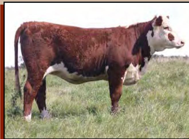
Aqua 44Y 5A

Exposed to ANL 521X Victor 65U 23Z from May 17 to August 10, 2014. Preg checked safe 90 days on August 22.