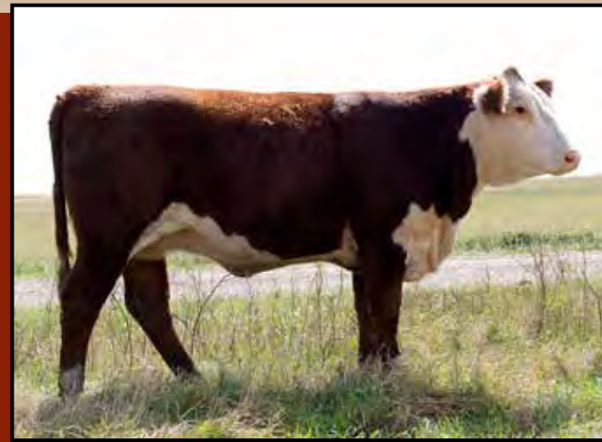
HANNA 62Y 71A

Preg. checked safe to second service for a mid-April calf.