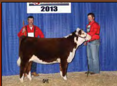
Haroldson's AD Jessica T100 4A Class Winner Purchased by Medonte Highlands Polled Herefords