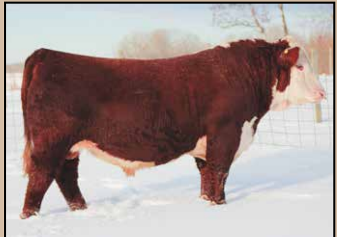
Agribition CHAMPION JUNIOR BULL CALF