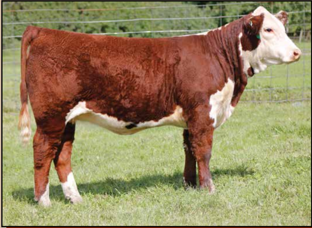
MARVEL 48Y 12B