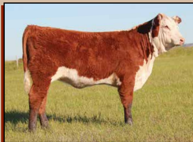
HOT TUSH 91B

Hot Tush 91B is an impressive individual. Big, roomy with lots of volume and power. Tons of hair further enhances her value. You will note she is a granddaughter of Future Fanny 9J, the great donor dam for Al Toles and Remitall. This is one we should be keeping but our loss is your gain.