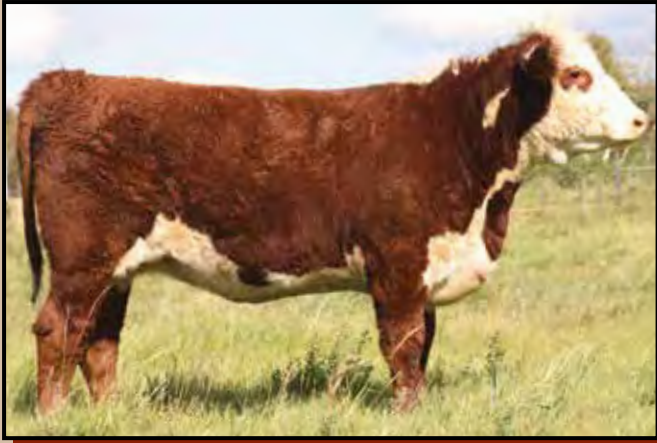
ARDEN 51X 22A