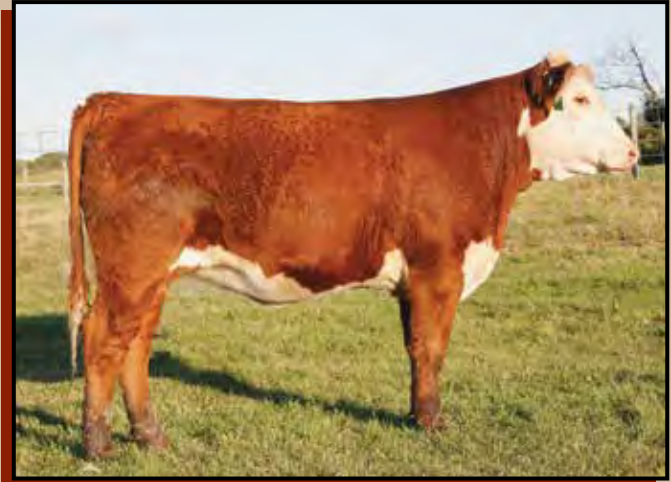
Tess 99X 35A

Bred to Churchill Red Bull 200Z on May 31, 2014. Exposed to Haroldson's WLC Reno ET 15W till August 1, 2014.