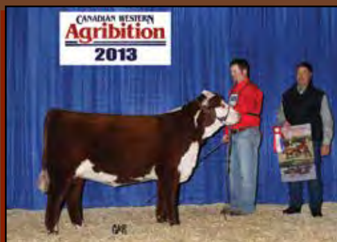
Haroldson's Mira ET 31A Champion Junior Heifer Calf Owned with Warrayca Land & Cattle