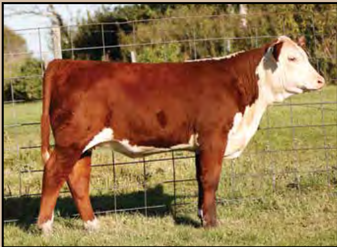
Jessica 48Y 13B

Here is another high quality female from the Sarah cow family. This heifer is dark cherry red with extra pigmentation. She is a real big bodied, easy doing heifer that will make an excellent female when she enters production.