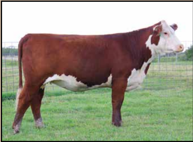
ELLA 92Y 28A

LOT 66 HAROLDSONS LV Ella 92Y 28A FEMALE PC02981985 AFSY 28A MAR 5, 2013