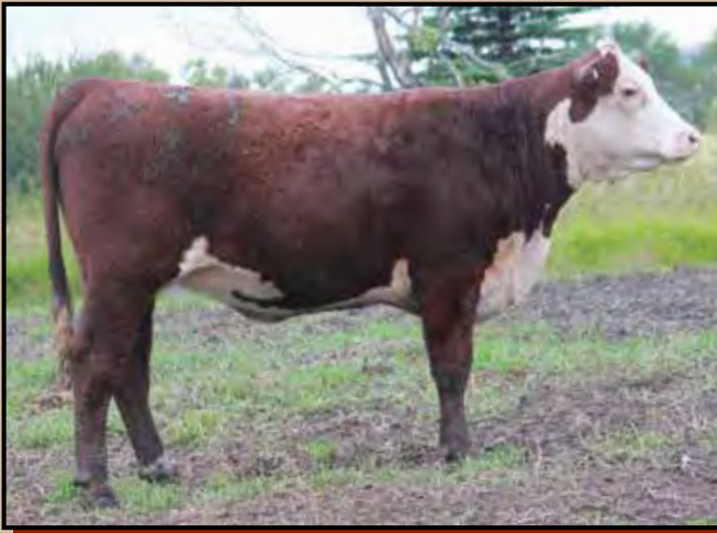
Icing Sugar 120A

LOT 33 Blair-Athol Icing Sugar 120A FEMALE PC02984128 DVL 120A Apr 15, 2013