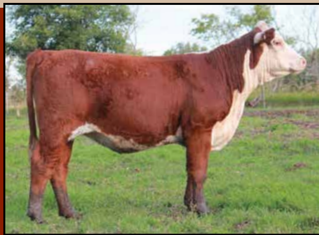
Classic Kay 273A