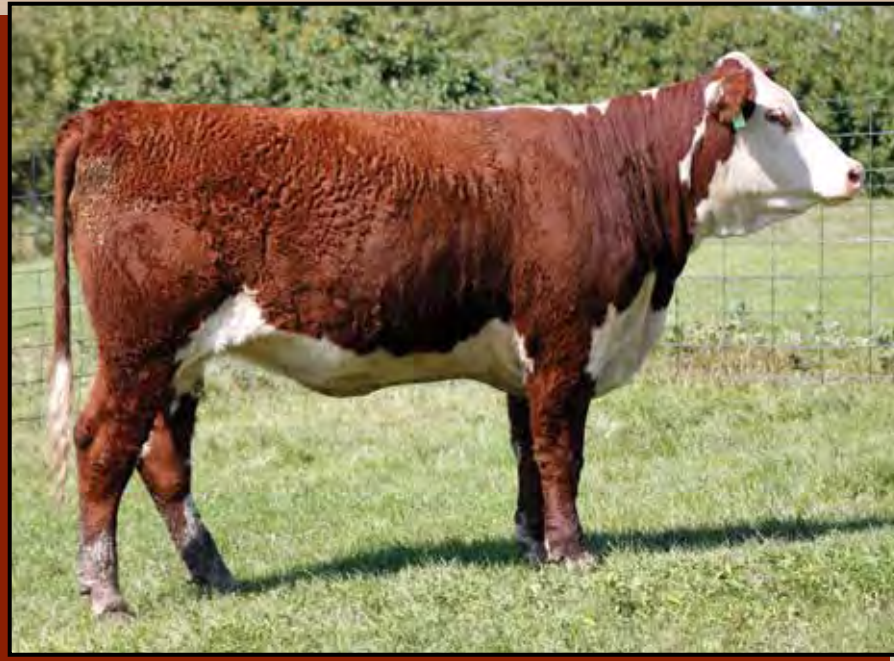
MIRA ET 23A

LOT 60 HAROLDSONS WLC Mira ET 23A DLF IEF HYF FEMALE PC02989497 AFSY 23A MAR 2, 2013