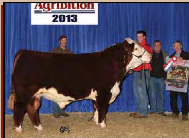
DOWNHOME 21Z SERVICE SIRE TO LOT 14