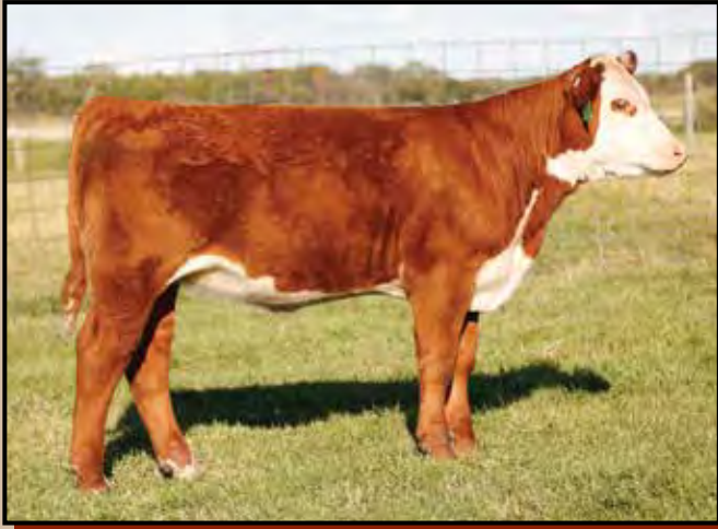
Rythm 12Z 16B