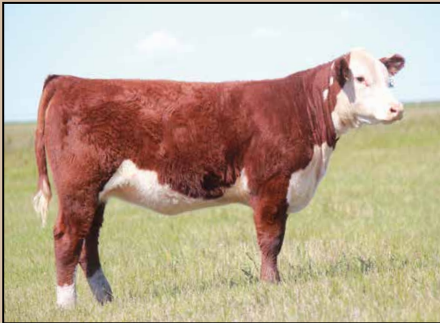
J Lo 14B

Some visitors have picked J Lo 14B as our best heifer calf. Sweet fronted with lots of top, deep ribbed and big butted, she will show and more! Out of the great breeding Centerfold cow that was purchased by Abby Hill for $11,000 in 2008. She is a clone of her mother! A full sister sold to the Freitags in 2013 and is doing a great job. Maternal sister sells as Lot 23. Owned jointly with Abby Hill Farms. Entered in Agribition.