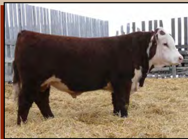
TANK 45P 10W

If there is a question of parentage due to birthdate of the resulting calves, Roselawn will pay to parentage test the calf for you.