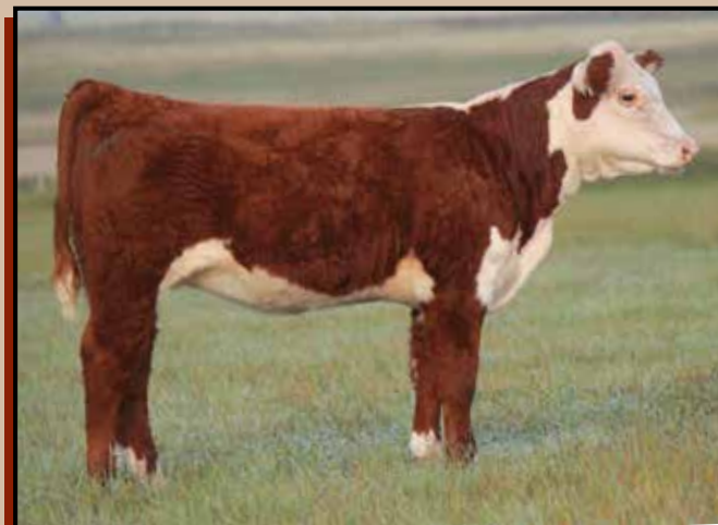
WINTER HEAT 36B

Pretty as a picture, this Heater/Absolute cross is made so nice! Not our biggest heifer but she will make a great yearling show heifer. Very deep ribbed, sound and sweet. She comes to you highly recommended! Maternal sister sells as Lot 14.