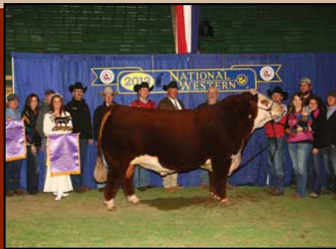
Time's A Wastin'