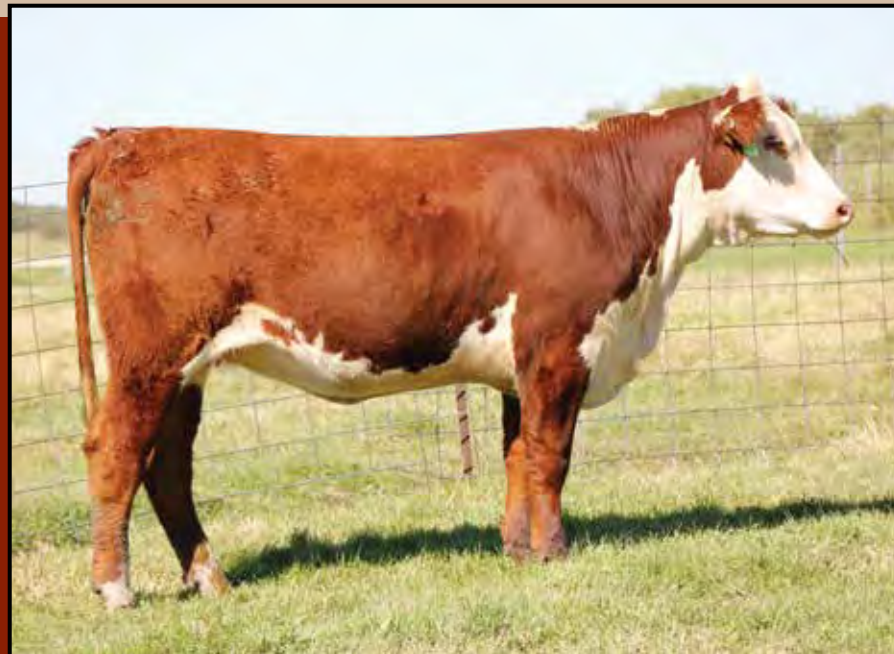
MIRA ET 26A

26A – Exposed to Haroldson's WLC Reno ET 15W from June 1 to August 1, 2014. Observed bred on June 12.