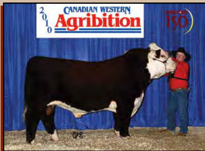
WALK HARD 154U - MATERNAL GRANDSIRE

A good thick Tank x Walkhard son. This has been a very good cross at Roselawn. He has a bright future here. Service sire to Lot 46.