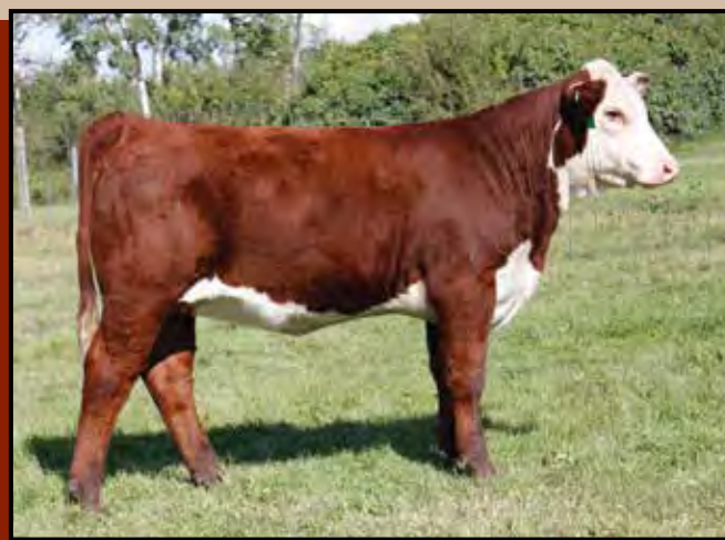
Lassie 48Y 17B

Another top prospect by Rhino. Lassie is a powerful made female who is big bodied and stout made. She is a dark red female with great cosmetics. Her dam is a high quality Patriot daughter that consistently brings in high quality offspring.