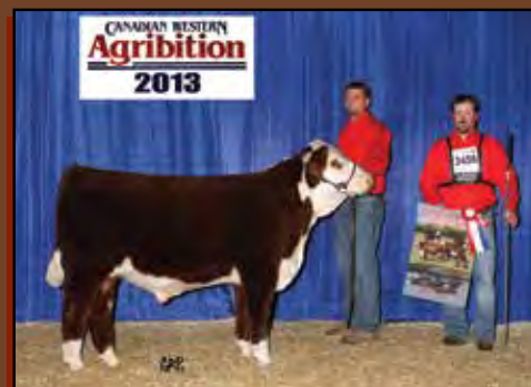
Haroldson's Lock Down ET 37A Champion Junior Bull Calf Owned with Maple Hill Farms