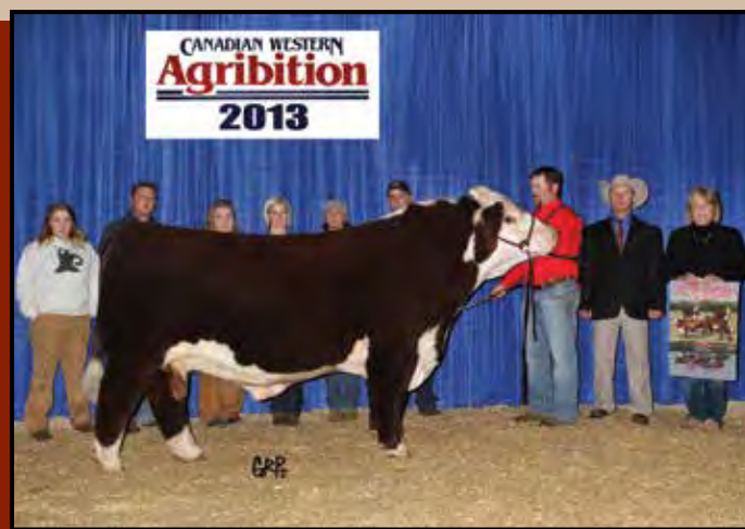
Young Gun 4T 92Y SIRE of LOT 63

Exposed to Haroldson's WLC Reno ET 15W from June 1 to August 1, 2014.