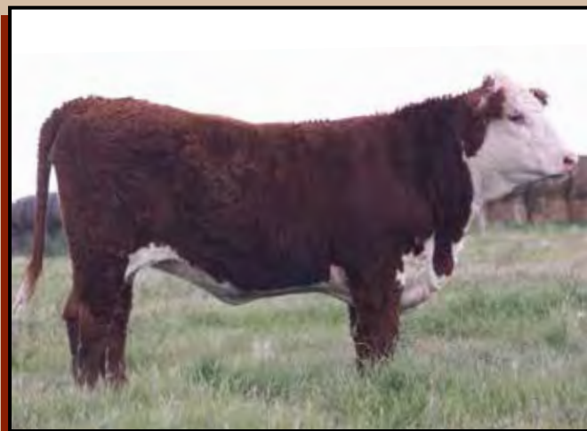
Alice 729T 42A

Exposed to ANL 521X Victor 65U 23Z from May 17 to August 10, 2014. Preg checked safe 70 days on August 22.