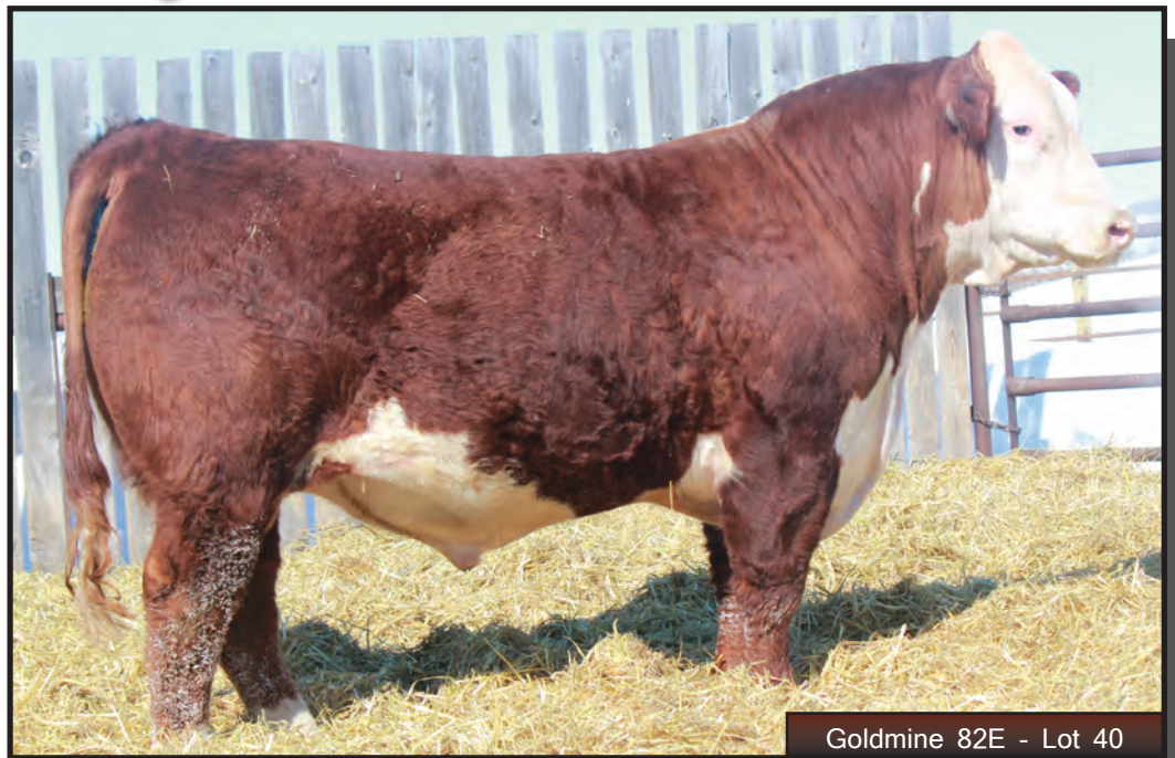
Goldmine 82E - Lot 40