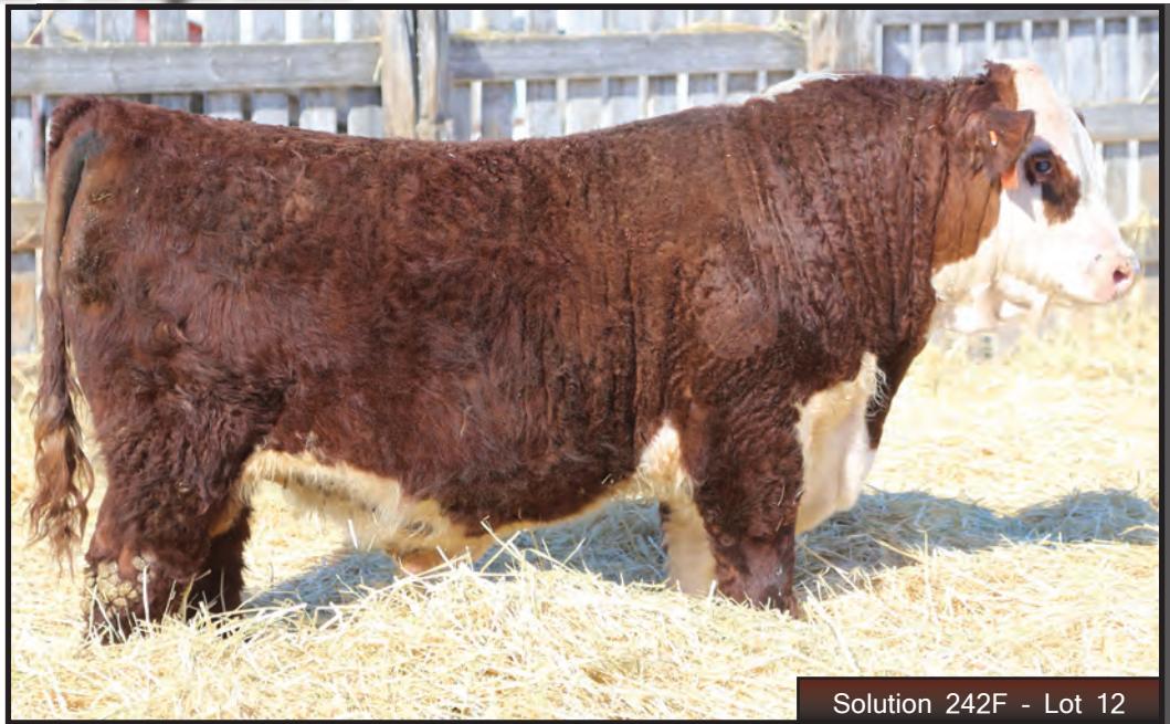
Solution 242F - Lot 12