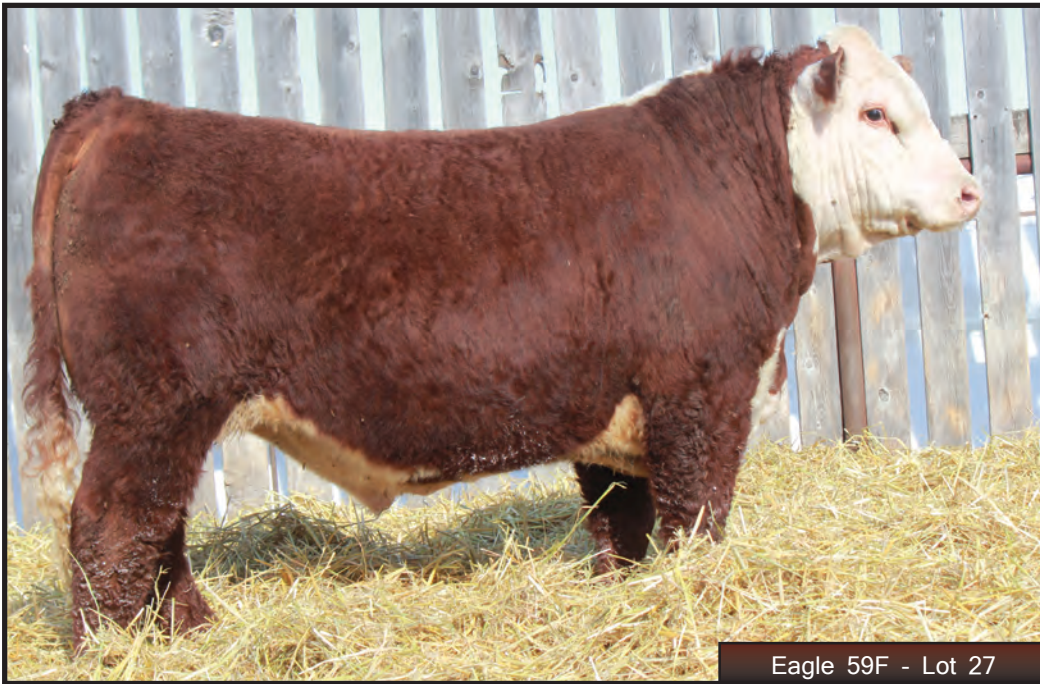
Eagle 59F - Lot 27

MHPH 101S UMPIRE 118U MHPH 118U CATRIONA 1071Z WILD-OAK 40U XTINA 18X