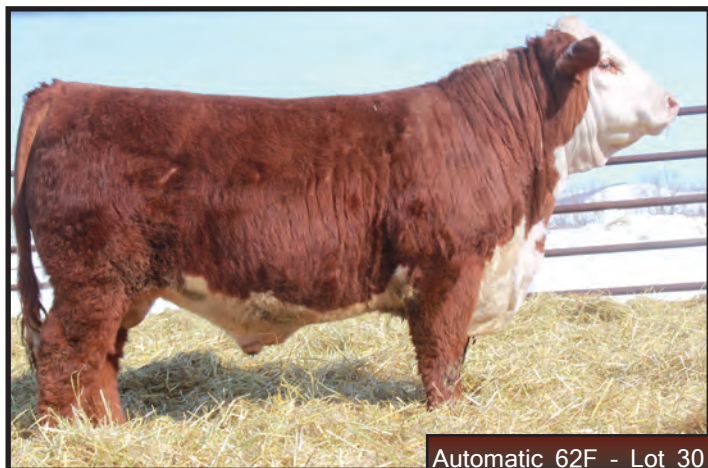
Automatic 62F - Lot 30