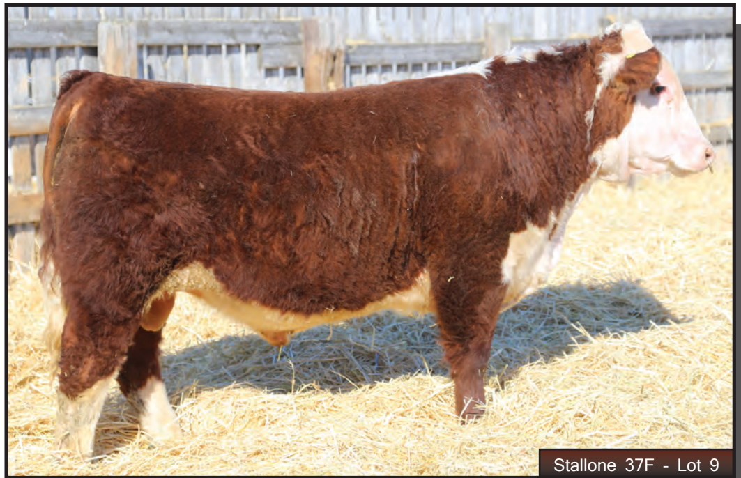
Stallone 37F - Lot 9