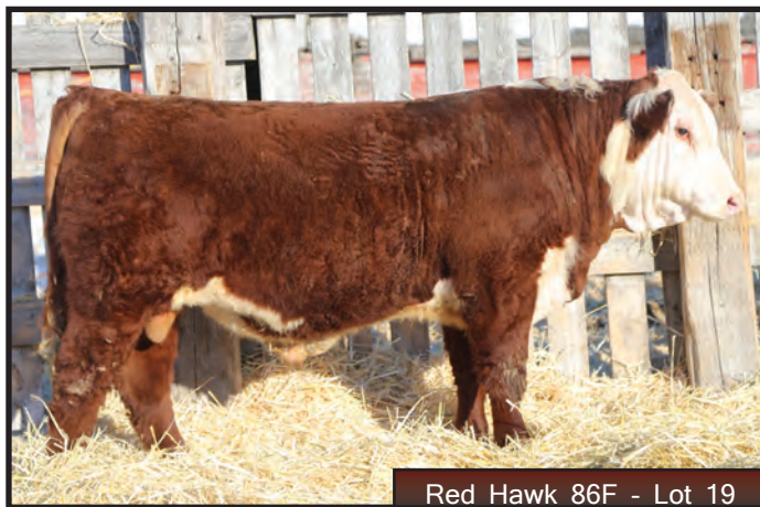
Red Hawk 86F - Lot 19

A Red Zone son with some extra performance and extension. His young Rhino mother is beautifully uddered with extra milk flow.