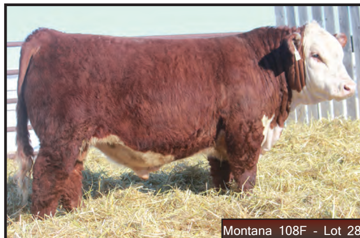
Montana 108F - Lot 28