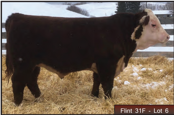
Flint 31F - Lot 6

What a bull! Heavily speckled, very easy keeping and great feet. His dam is also heavily speckled and great milking. Owned with Ross Madsen, Wauchope, SK.