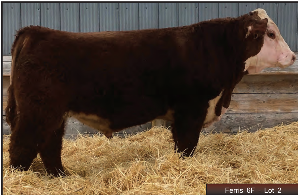
Ferris 6F - Lot 2

PW VICTOR BOOMER P606 ANL P606 NORTHERN LADY 38X HF 59M NORTHERN LADY 275S