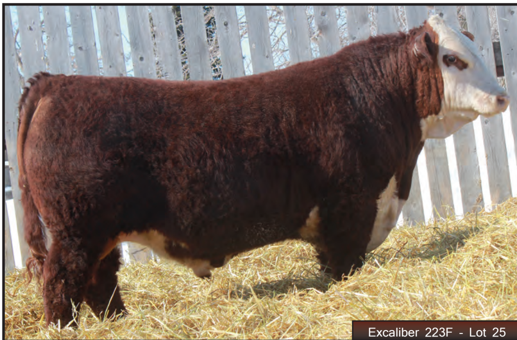
Excaliber 223F - Lot 25