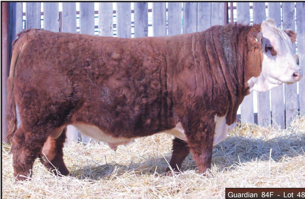
Guardian 84F - Lot 48

BNMHPH 13P HEAT 101S GLENLEES 101S LIBBY 21Y WTK ANL 705G LIBBY 114P