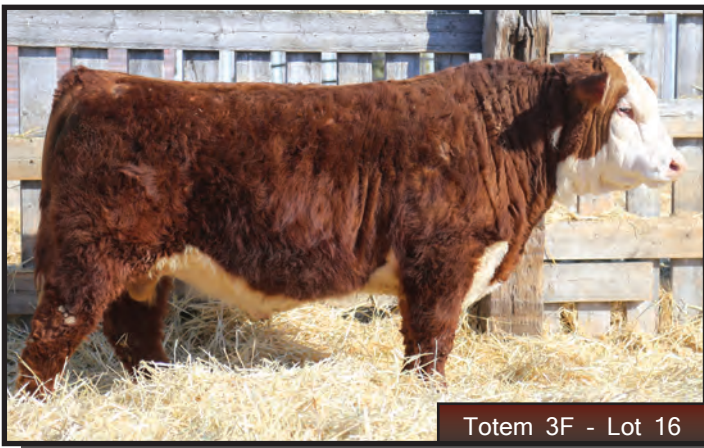
Totem 3F - Lot 16

16 HAROLDSON'S Totem 5D 3F PC03049346 AFSY 3F FEB. 8, 2018 POLLED