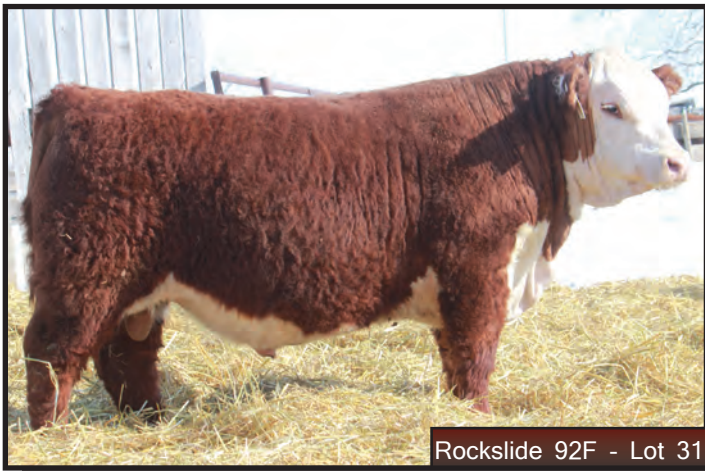
Rockslide 92F - Lot 31