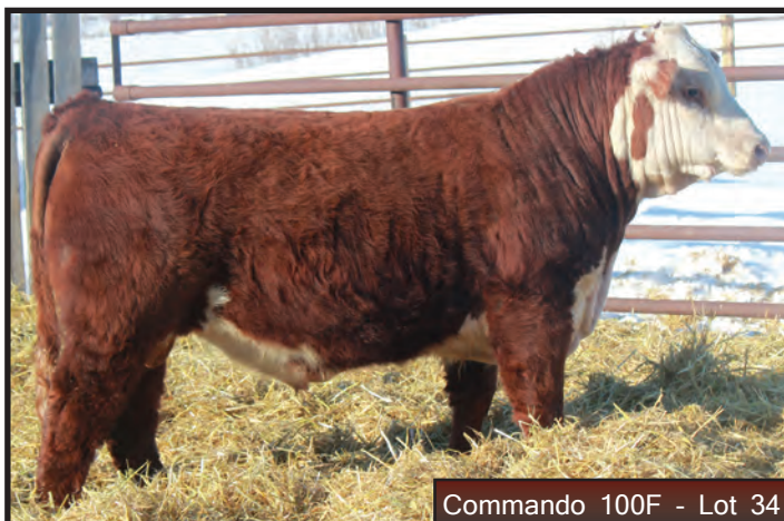
Commando 100F - Lot 34