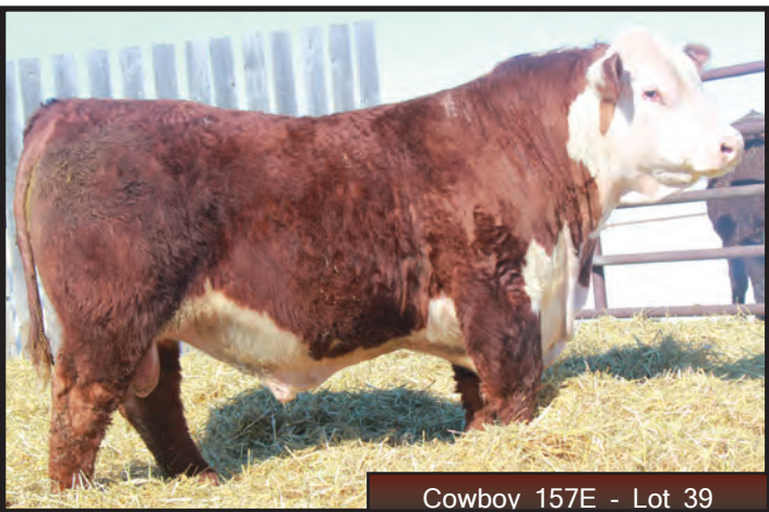
Cowboy 157E - Lot 39

39 BLAIR-ATHOL 60Z Cowboy 157E DLF IEF HYF PC03036740 DVL 157E MAY. 8, 2017 POLLED