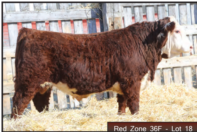
Red Zone 36F - Lot 18

This bull is short marked and long sided. He is a maternal brother to our past high seller and herd sire, Upgrade.