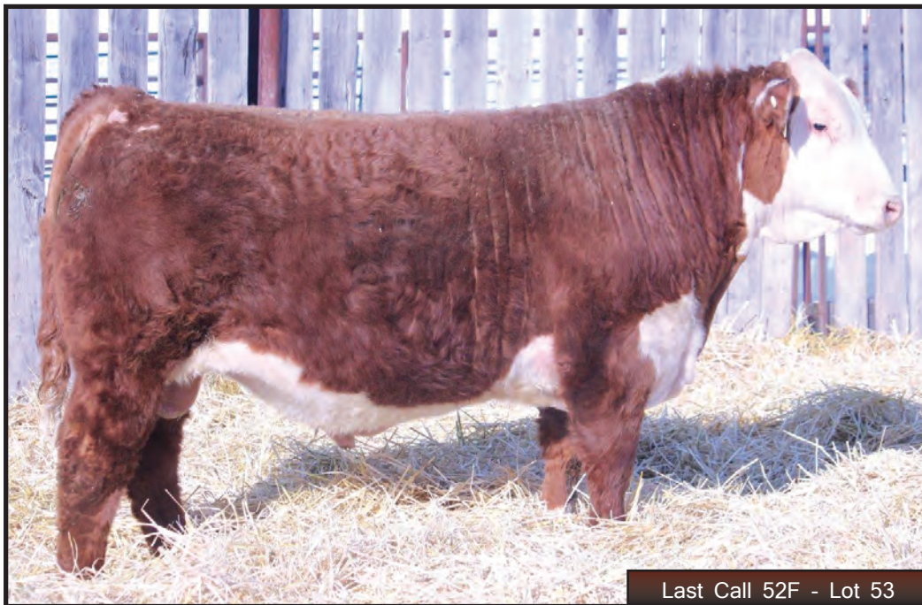
Last Call 52F - Lot 53

GHR TAURUS 4J 42T SQUARE-D TANYA 329Z SQUARE-D NADIA 293P