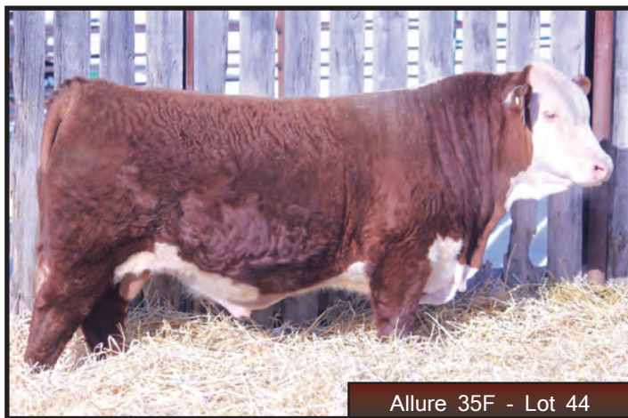
Allure 35F - Lot 44