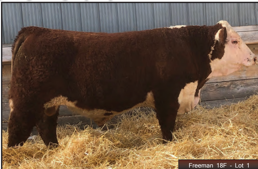
Freeman 18F - Lot 1