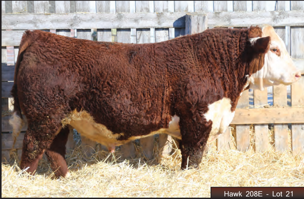
Hawk 208E - Lot 21

Hawk is a member of a very powerful and consistent flush. We kept him around to run with our heifer pen last year. He is short marked with a lot of turn and shape to his rib. He is wide based and very stout hipped. Heifer Approved.