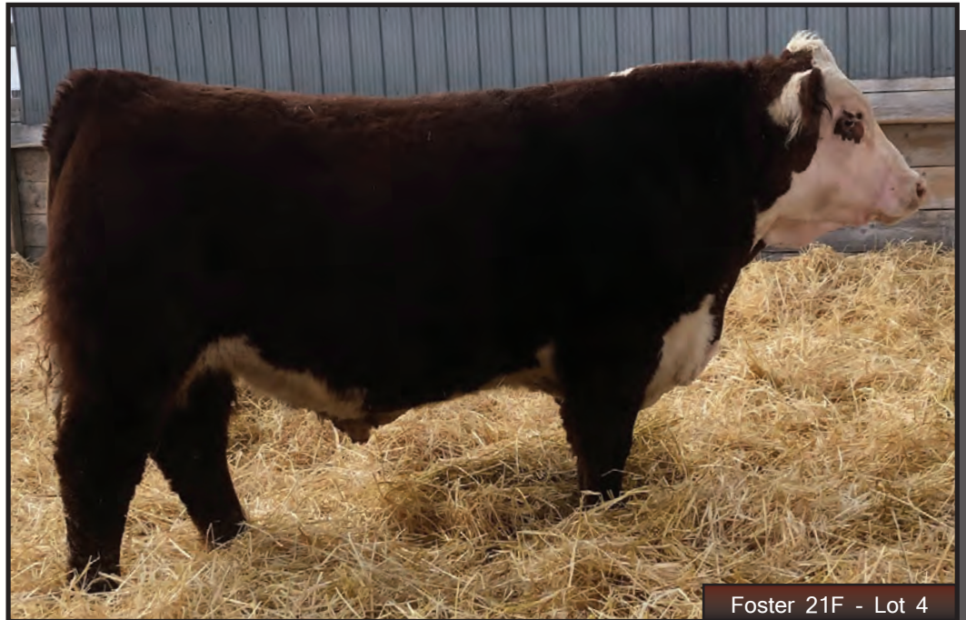
Foster 21F - Lot 4

Red everywhere, hide, neck and big red eyes. A very striking herd bull prospect. His dam is a thick, smaller framed, ANL Tank daughter.