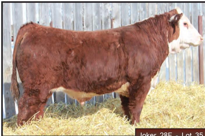
Joker 28F - Lot 35