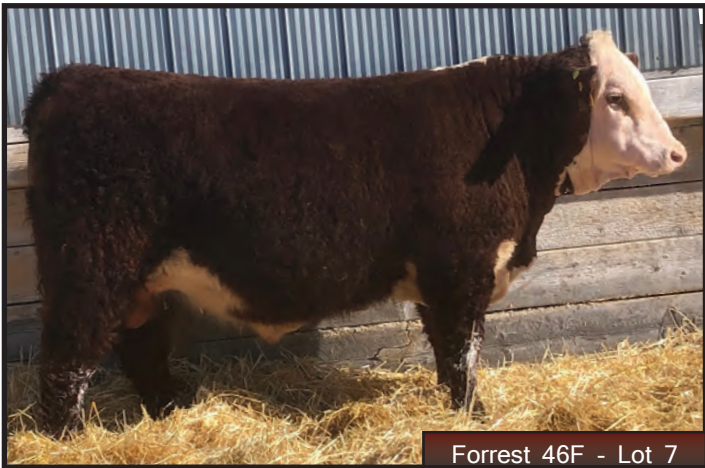
Forrest 46F - Lot 7