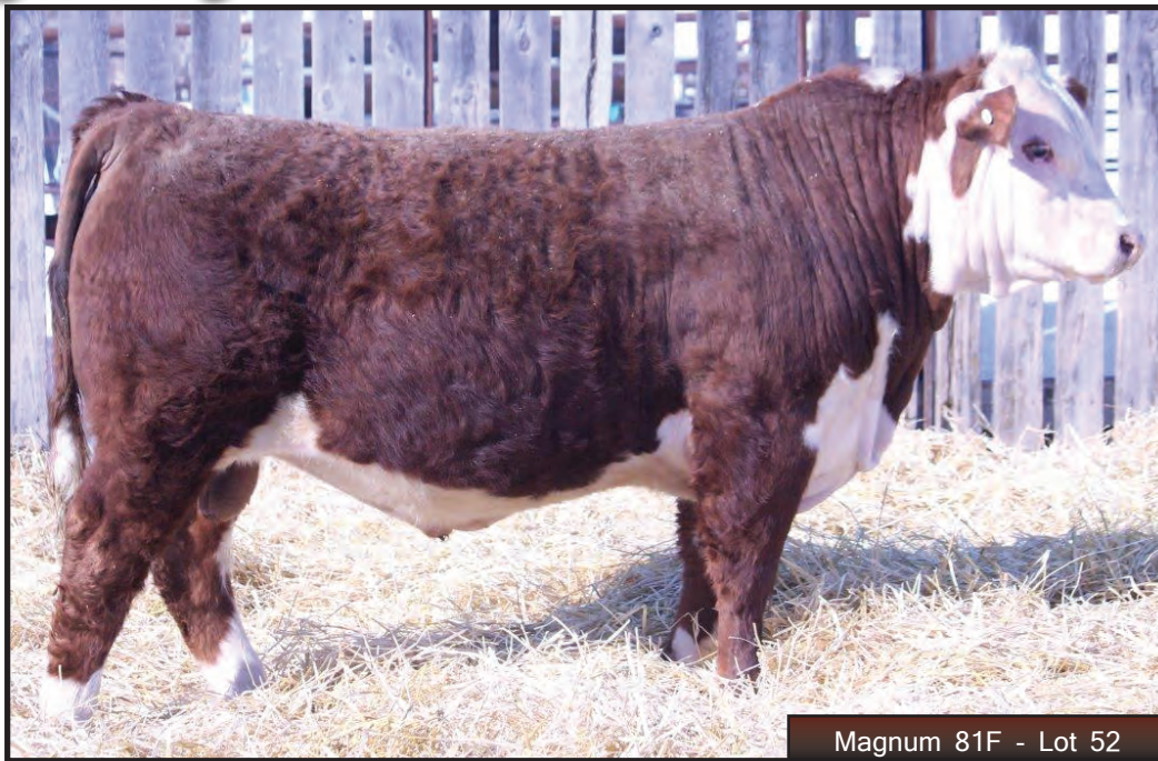
Magnum 81F - Lot 52