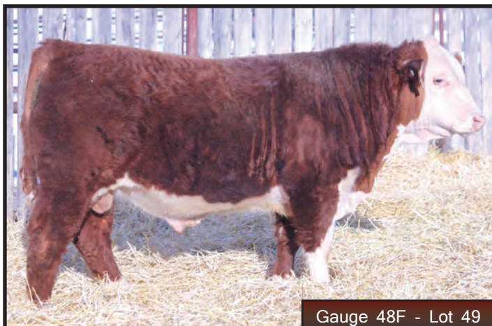
Gauge 48F - Lot 49