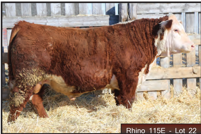
Rhino 115E - Lot 22

HAROLDSONS WLC RHINO ET 48Y HAROLDSON'S HLV MARVEL 48Y 12B HAROLDSON'S MARVEL 45P 5W