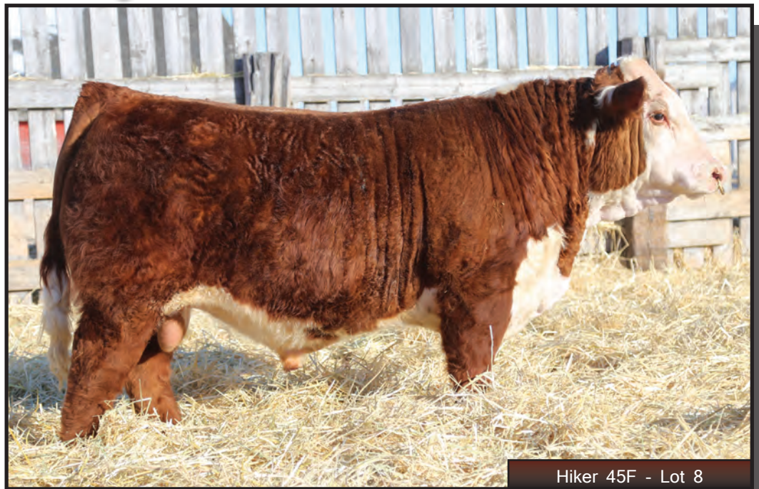
Hiker 45F - Lot 8