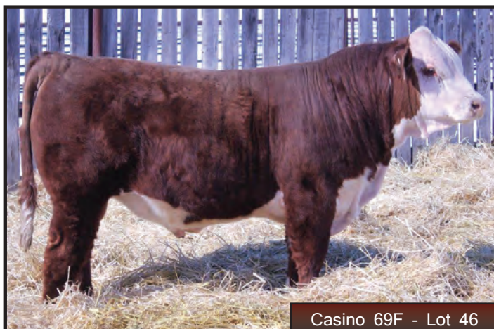
Casino 69F - Lot 46