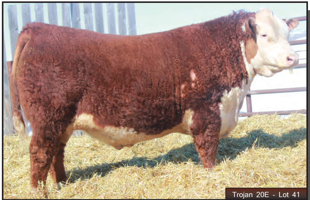
Trojan 20E - Lot 41