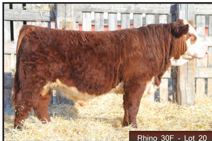
Rhino 30F - Lot 20

This bull will add that extra colour to a set of calves.