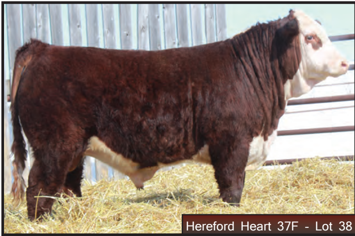
Hereford Heart 37F - Lot 38

38 BLAIR-ATHOL Hereford Heart 37F PC03049958 DVL 37F FEB. 25, 2018 POLLED