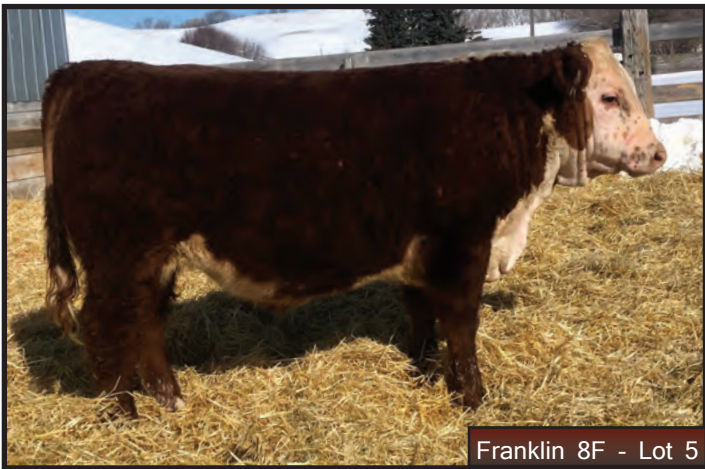
Franklin 8F - Lot 5