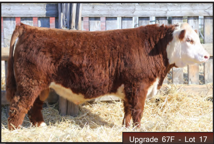
Upgrade 67F - Lot 17

17 HAROLDSON'S Upgrade 33D 67F PC03056478 AFSY 67F MAR. 27, 2018 POLLED