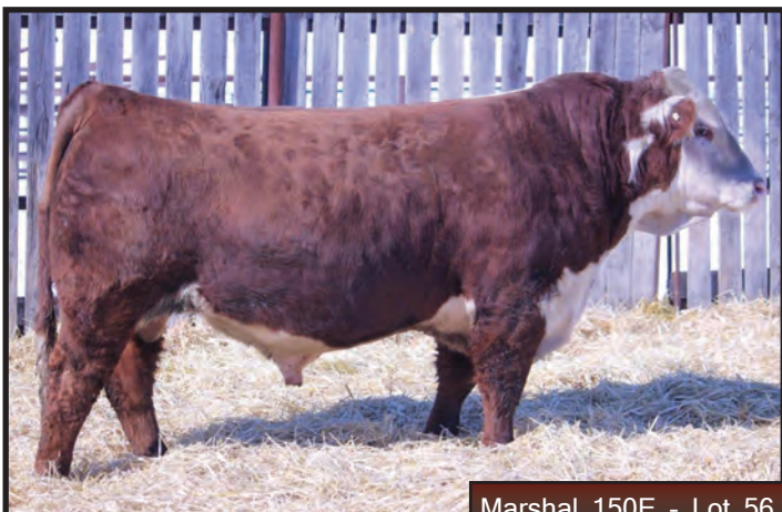
Marshal 150E - Lot 56