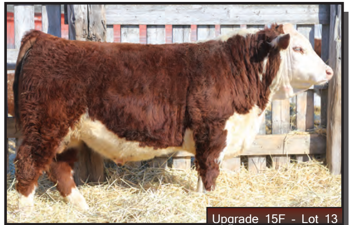
Upgrade 15F - Lot 13

This Upgrade bull is stout made with an abundance of rib and shape. He is an easy doing individual with a lot of maternal strength in his pedigree.