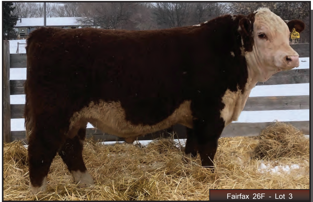
Fairfax 26F - Lot 3