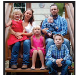
C&T Cattle Co.