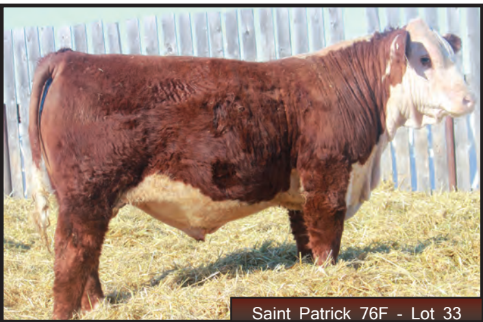
Saint Patrick 76F - Lot 33