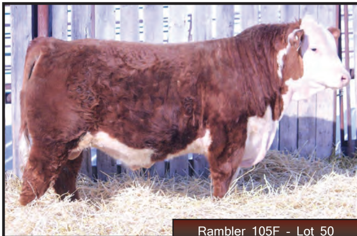
Rambler 105F - Lot 50