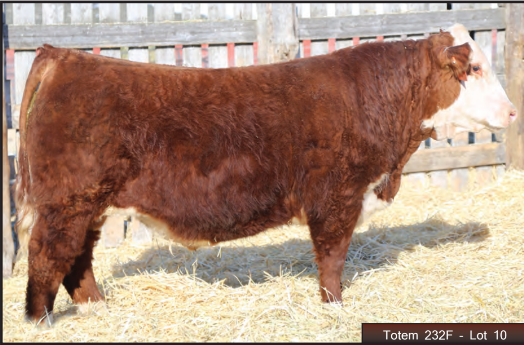
Totem 232F - Lot 10

A real eye catcher here. This bull is short marked with that added style. When viewed from all angles, this bull will impress you with his added shape to his hip and center body.