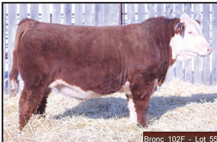
Bronc 102F - Lot 55