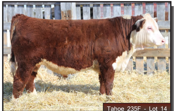
Tahoe 235F - Lot 14