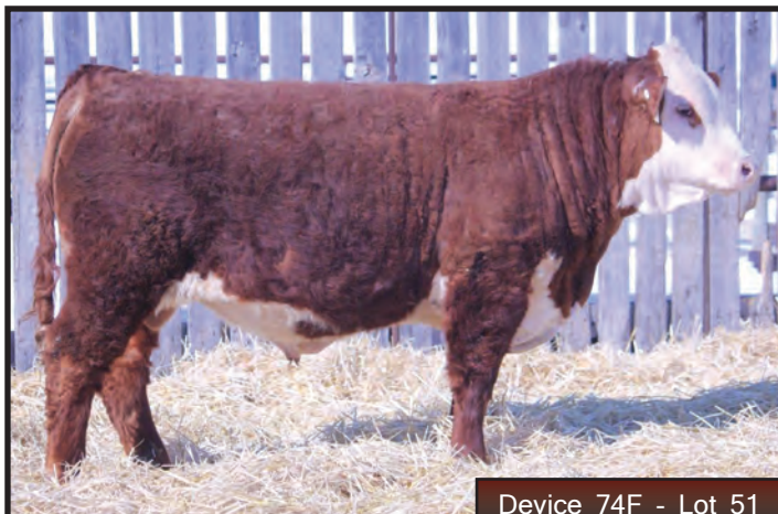
Device 74F - Lot 51