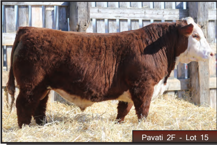
Pavati 2F - Lot 15

15 HAROLDSON'S SK Pavati 5D 2F PC03049373 AFSY 2F FEB. 2, 2018 POLLED