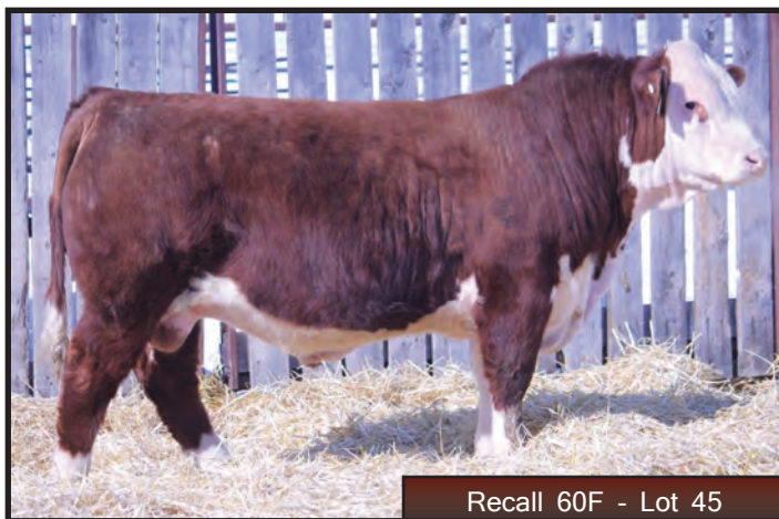
Recall 60F - Lot 45