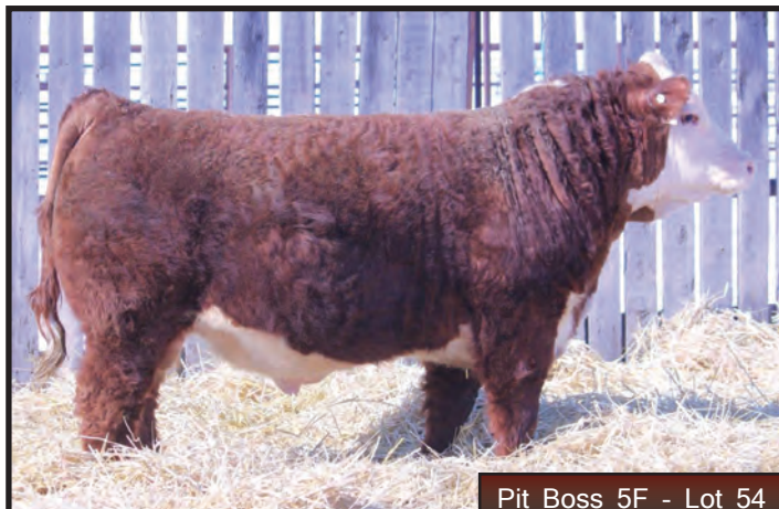
Pit Boss 5F - Lot 54