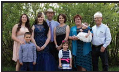
Blair-Athol Polled Herefords