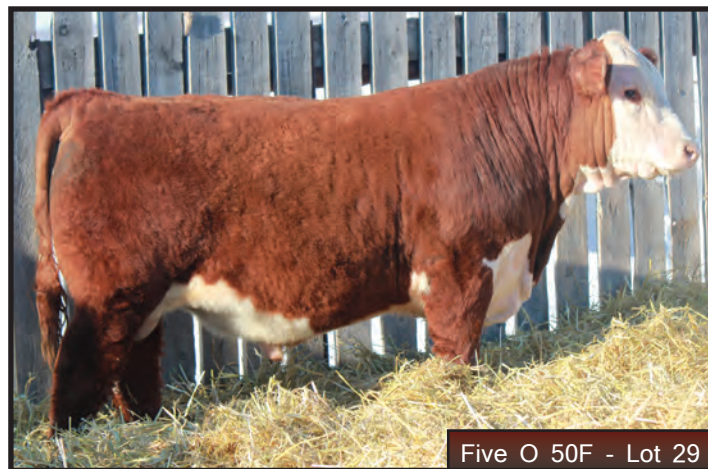
Five O 50F - Lot 29