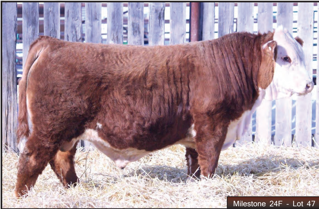
Milestone 24F - Lot 47