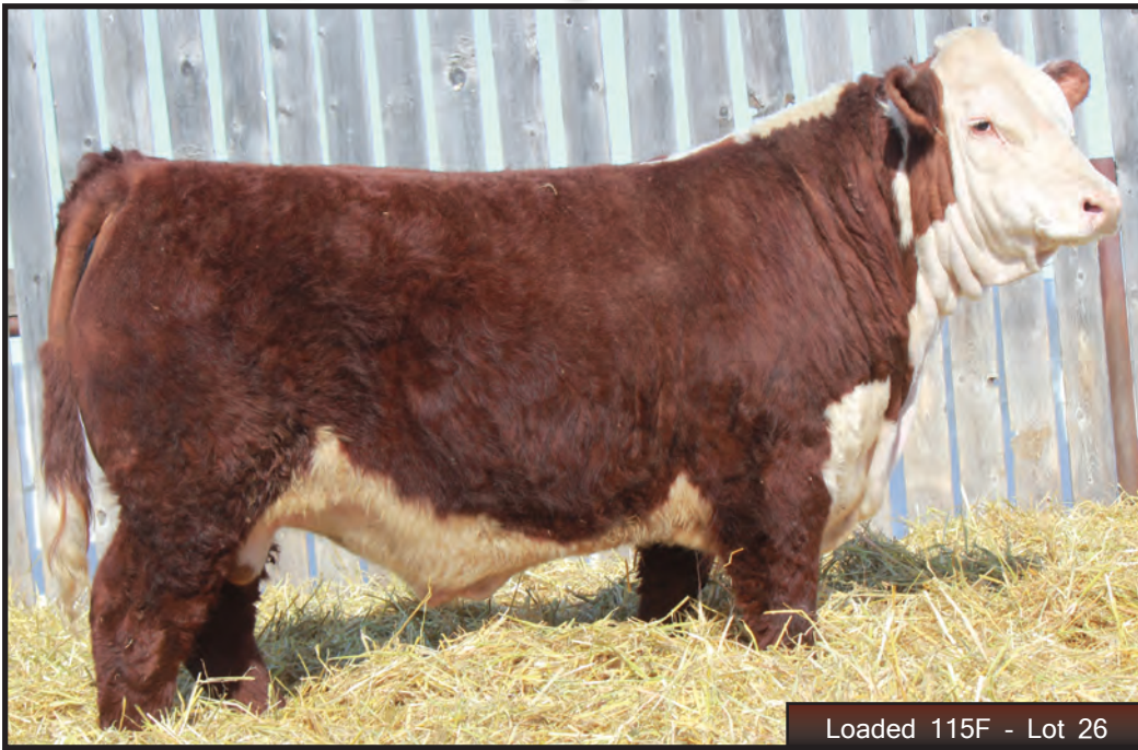
Loaded 115F - Lot 26

Max x Umpire. So well balanced with style and muscle. Just an April calf but fits in with the older bulls very easily. 115F stood second in a strong class at Agribition. Dam is one of our top cows.