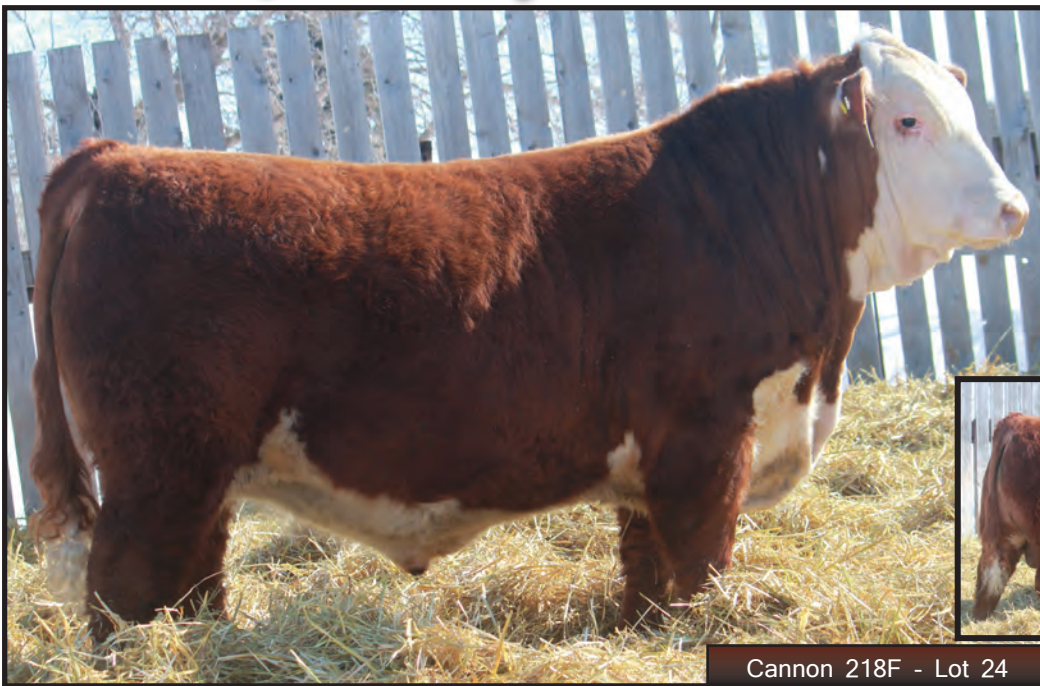
Cannon 218F - Lot 24