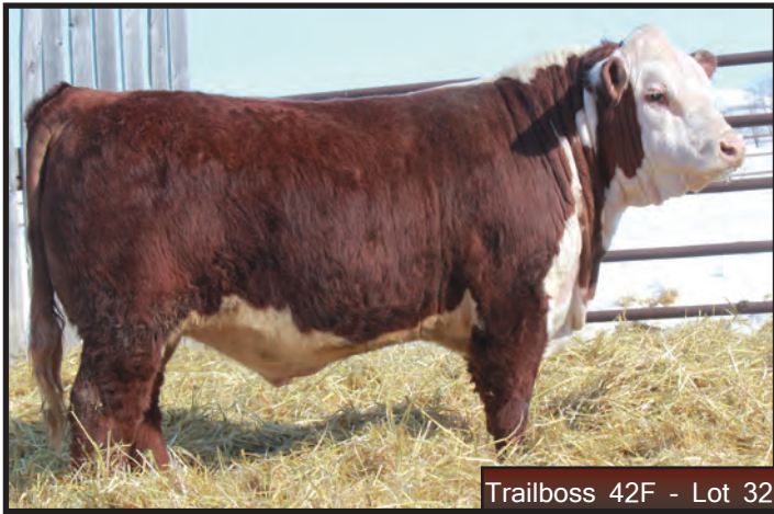
Trailboss 42F - Lot 32