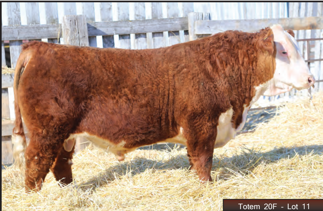
Totem 20F - Lot 11

HAROLDSONS WLC RHINO ET 48Y HAROLDSON'S HLV MARVEL 48Y 12B HAROLDSON'S MARVEL 45P 5W