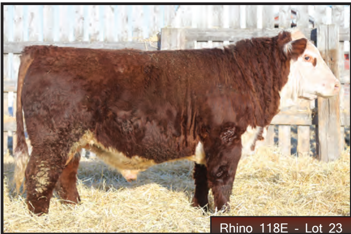
Rhino 118E - Lot 23