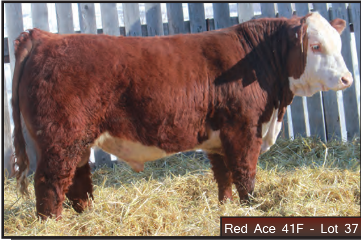
Red Ace 41F - Lot 37

37 BLAIR-ATHOL Red Ace 41F PC03049959 DVL 41F FEB. 28, 2018 POLLED