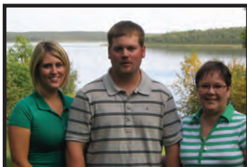
Haroldson's Polled Herefords

C: 306-577-1256 F: 306-739-2902 www.haroldsons.com