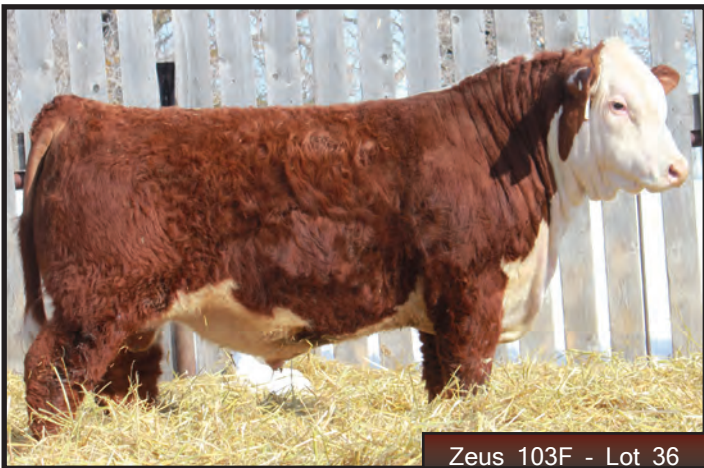
Zeus 103F - Lot 36