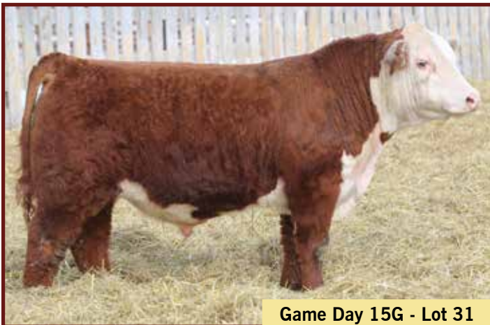
Game Day 15G - Lot 31

An April bull calf here that is long sided with an abundance of shape. He is vey sound with a great presence to him.