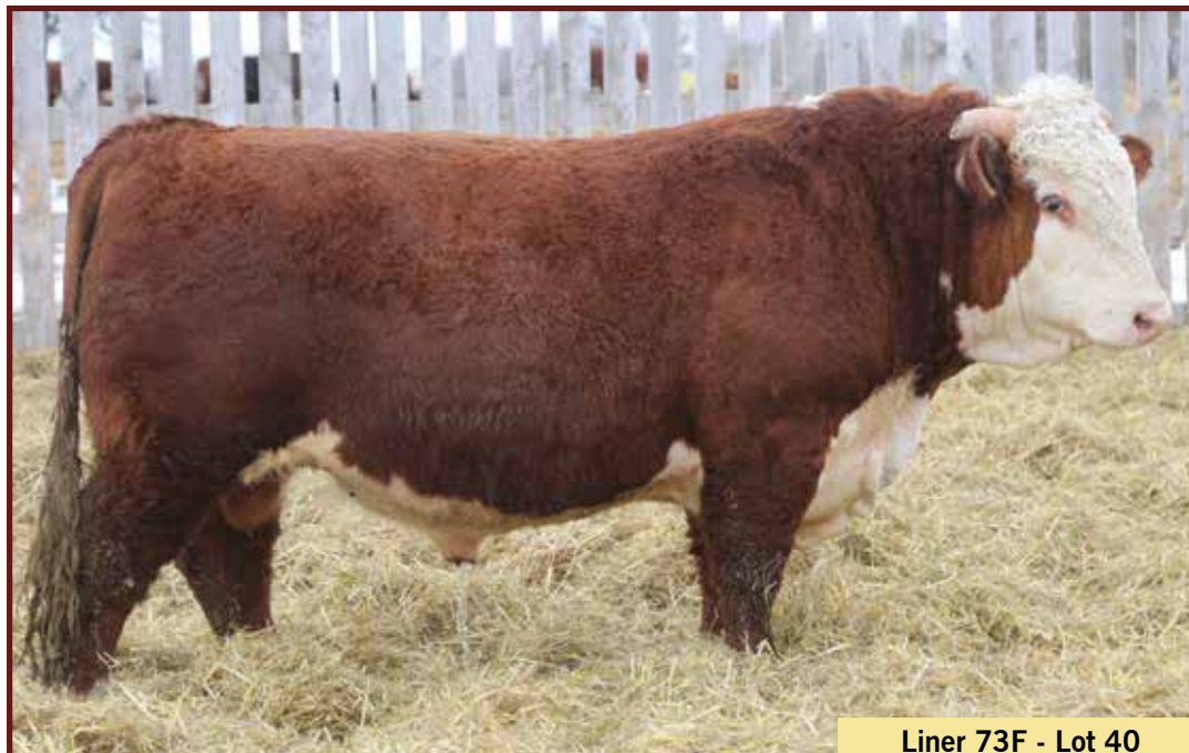
Liner 73F - Lot 40

This horned bull is very good footed and sound structured. He is a deep sided bull that is very fault free.