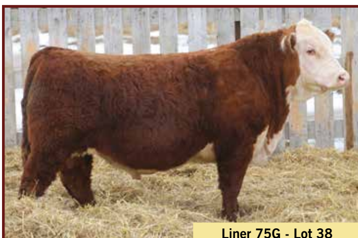
Liner 75G - Lot 38

Complete made, Red Zone son with a great coat of hair.