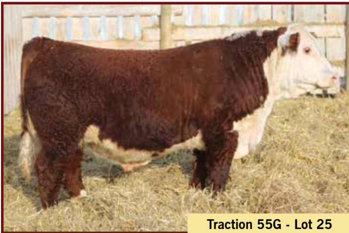
Traction 55G - Lot 25