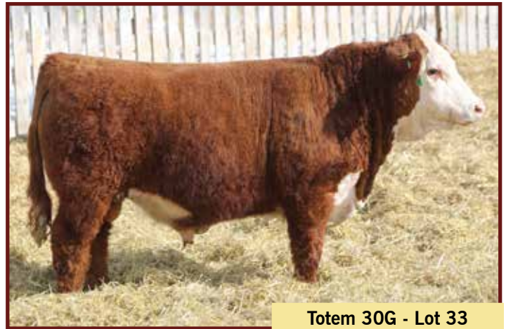
Totem 30G - Lot 33