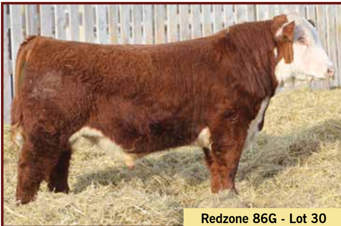
Redzone 86G - Lot 30