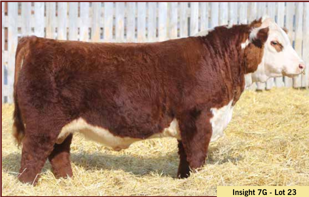
Insight 7G - Lot 23

This red eyed, Insight son is very complete made with some added hip shape. His mother is a full sister to our Traction herd sire and is now in our donor pen.