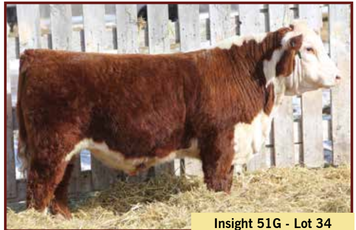
Insight 51G - Lot 34