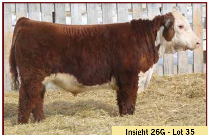
Insight 26G - Lot 35