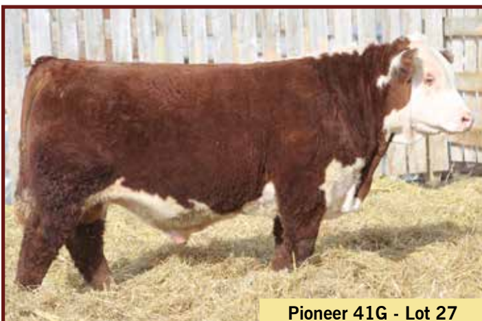
Pioneer 41G - Lot 27

Another Traction with some added performance. This bull is fault free with a lot of middle and shape from behind.