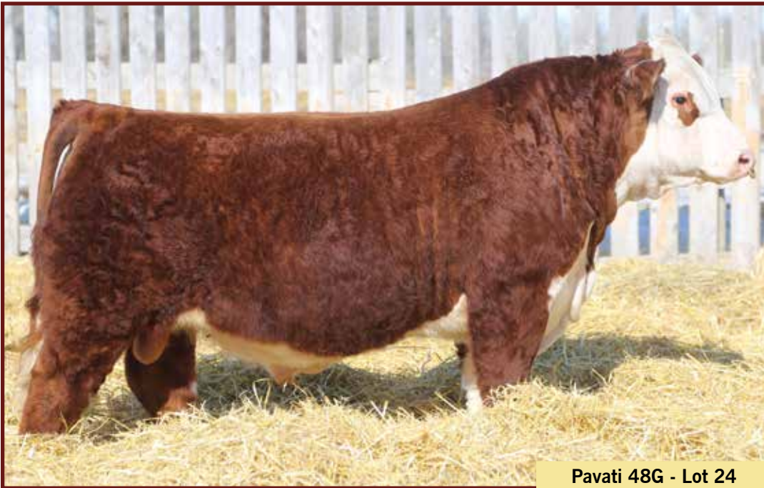
Pavati 48G - Lot 24

Pavati is a bull that's always been at the top of my list. Big topped and stout made with a great look. He is very sound structured with an amazing foot. The Rhino daughters are beautiful uddered with tremendous milk flow. He was Reserve Junior Calf at CWA last fall. Pavati will be a big part of our program.