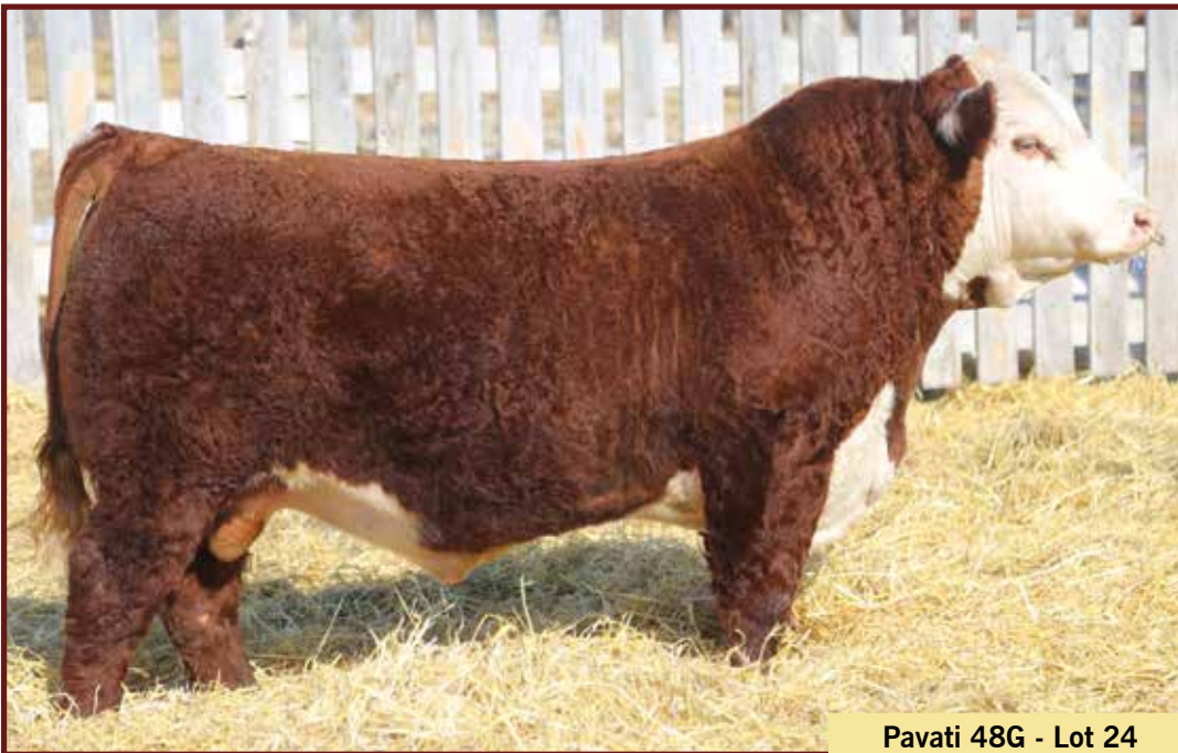
Pavati 48G - Lot 24

Red Zone is stout made, high performing and easy doing with huge nuts. He is a bull that puts a lot of good together in one package. His mother has been a tremendous producer. He was Reserve Senior Bull Calf last fall at CWA.