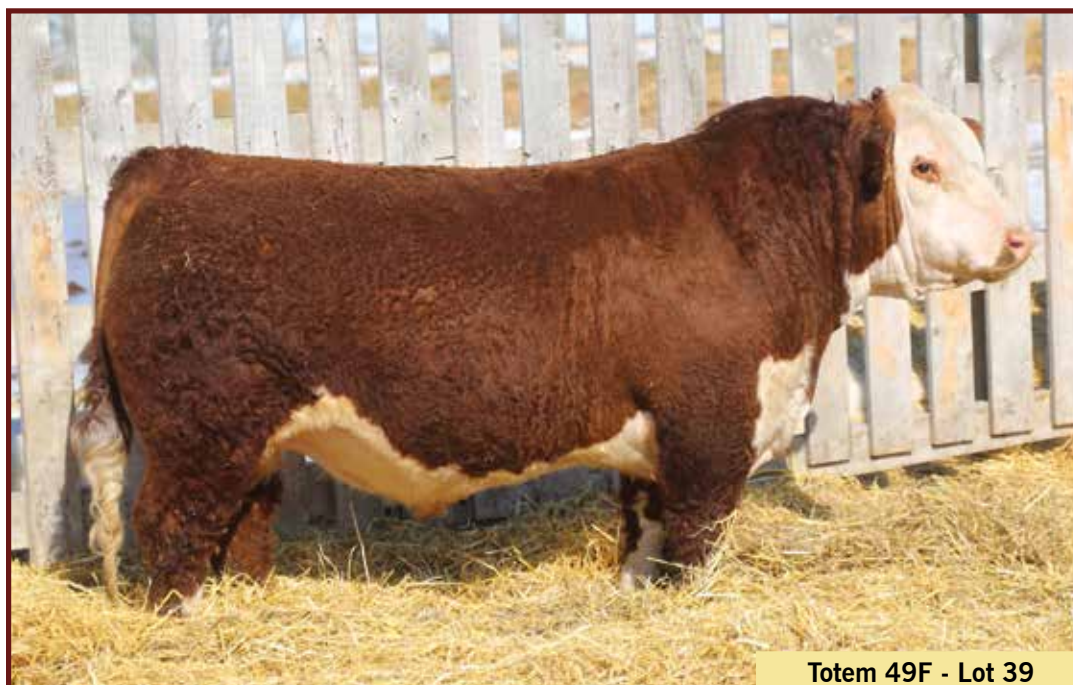
Totem 49F - Lot 39

Totem 49F is a good headed, big barreled bull that has that extra shape to his stifle and quarter. He is part of a very popular flush and is a bull we kept to use on our heifers last year.