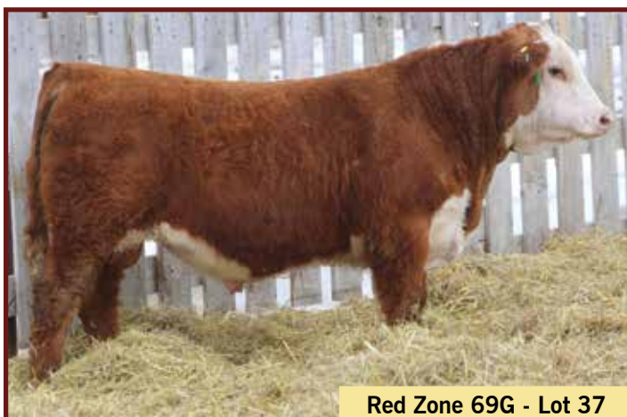
Red Zone 69G - Lot 37

This bull is long bodied and sound made. Heifer Approved.