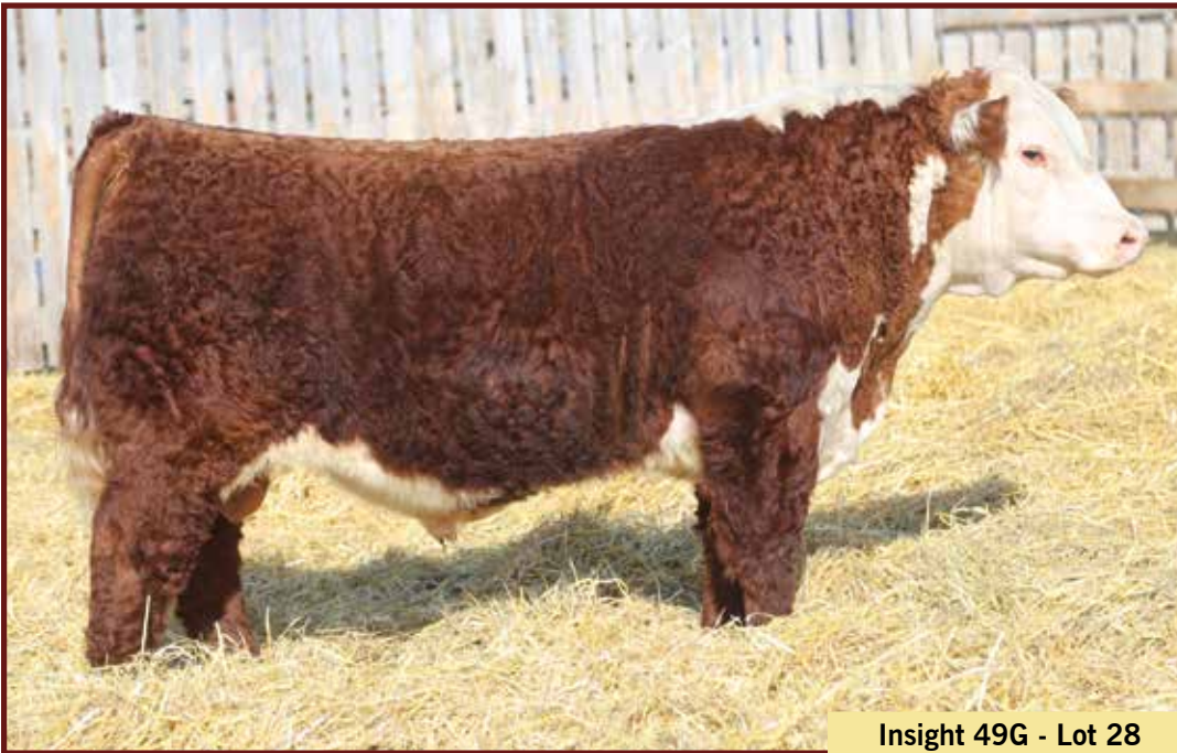
Insight 49G - Lot 28

This bull has a lot to offer. He is very complete made with a big top and is very stout when you get behind him. His mother has been our "go to" donor female and his full sister was our high selling female last fall.