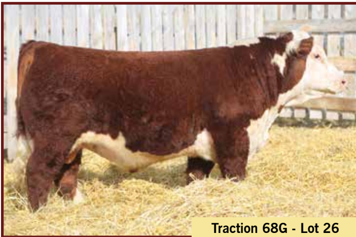
Traction 68G - Lot 26

This Traction son is very soft made with that extra fleshing ability. He will do an excellent job siring both sexes.