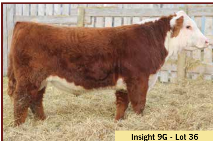
Insight 9G - Lot 36