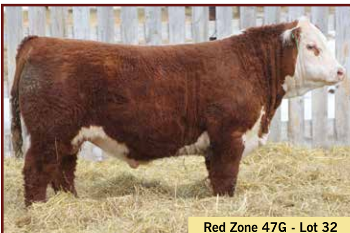
Red Zone 47G - Lot 32

This Game Changer son is a bull that the more you analyze the more you will like. He's big bodied, stout made, big boned and sound.