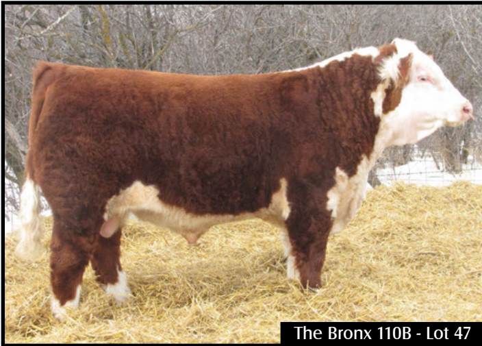
The Bronx 110B - Lot 47

47 SNBR-GL 1121Y The Bronx 110B DLF IEF HYF PC02993516 SNBR 110B JAN. 10, 2014 POLLED