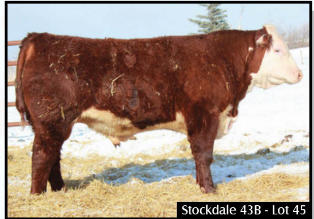
Stockdale 43B - Lot 45

Dark red, short marked Heater son with lots of performance. His dam was purchased from Stockdales in Pennsylvania. Full brother was very popular in last year's sale and sold to the Knapps in Southey for $5500. Born Unassisted.