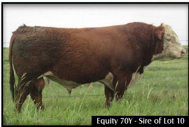
Equity 70Y - Sire of Lot 10