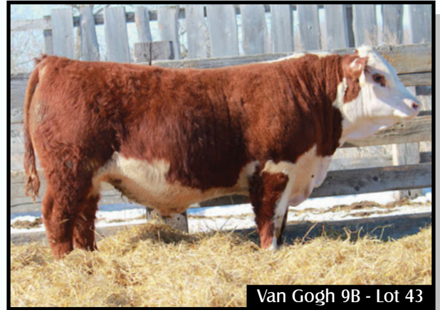
Van Gogh 9B - Lot 43