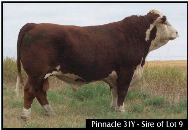
Pinnacle 31Y - Sire of Lot 9