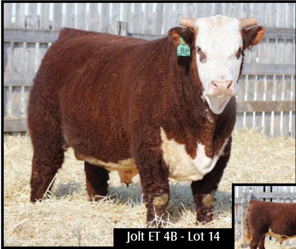
Jolt ET 4B - Lot 14

These two horned bulls by Masterpiece are by our top donor cow Mira. These bulls are rugged, stout, big bodied and easy fleshing. They will sire calves that will push down the scales and the daughters will be top quality replacements. A flush mate was one of our high sellers in our female sale and Junior Heifer Calf Champion at Agribition.