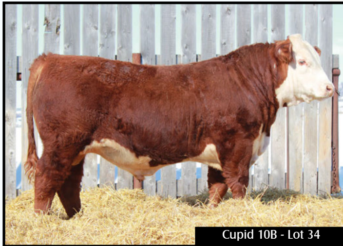
Cupid 10B - Lot 34

Extremely attractive son of Hometown. Red eyed, red necked and dark colour. This bull shows as nice a side profile as any bull selling. His dam 5P is one of our top cows sending females across the country. The 5P cow family now has 6 generations of females in production all at the same time at Blair Athol. Born Unassisted. HEIFER APPROVED.