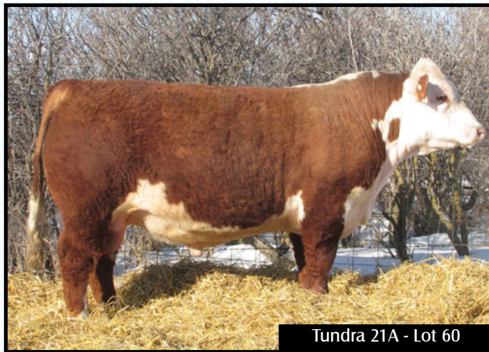
Tundra 21A - Lot 60

Powerful individual. Will add "pay weight" to your calves for fall. Fall born with extra age, great opportunity here.