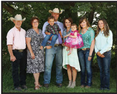
Blair-Athol Polled Herefords