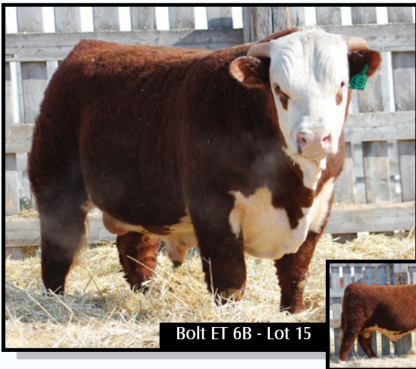
Bolt ET 6B - Lot 15

BW: 3.7 WW: 53.0 YW: 92.0 MILK: 20.5 TM: 47.0