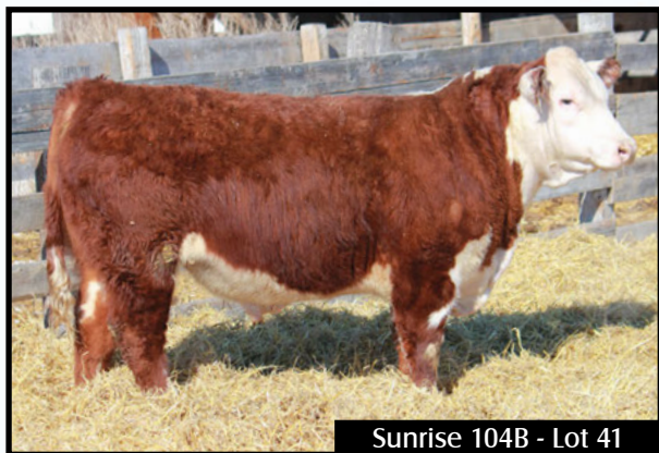
Sunrise 104B - Lot 41

Big stretchy Heater son out of a perfect udder Classic daughter. Lots of future left in this bull. You will like him more every day you own him. Born Unassisted.