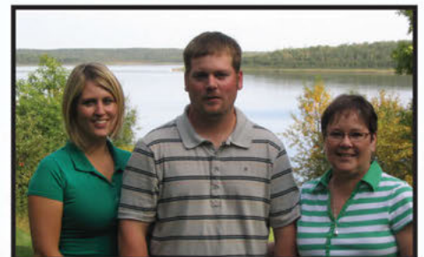
Haroldson's Polled Herefords