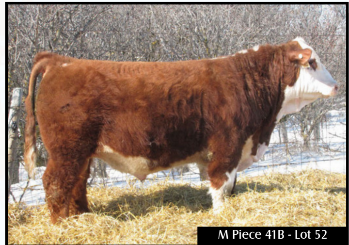
M Piece 41B - Lot 52

Fully pigmented and hairy with lots of middle and overall performance. Great mother.