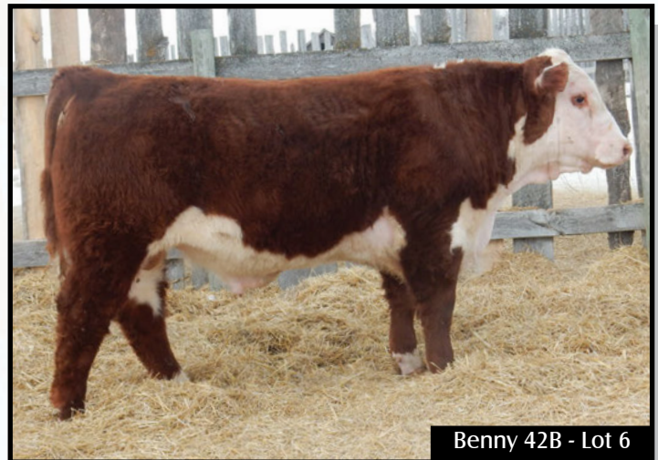
Benny 42B - Lot 6

A very neat package. Short marked with pigmentation. Benny is our first Mohican Stroker calf to sell. They are born super easy and very energetic. Out of another good milking young Nitrogen daughter. Use him on your heifers and sleep soundly. Owned with Lynn Madsen