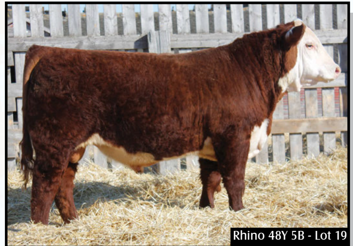
Rhino 48Y 5B - Lot 19

This is a high performance son of Rhino who is very long sided and has some extra extension to his front end. His mom is a nice tight uddered female who is an excellent producer.