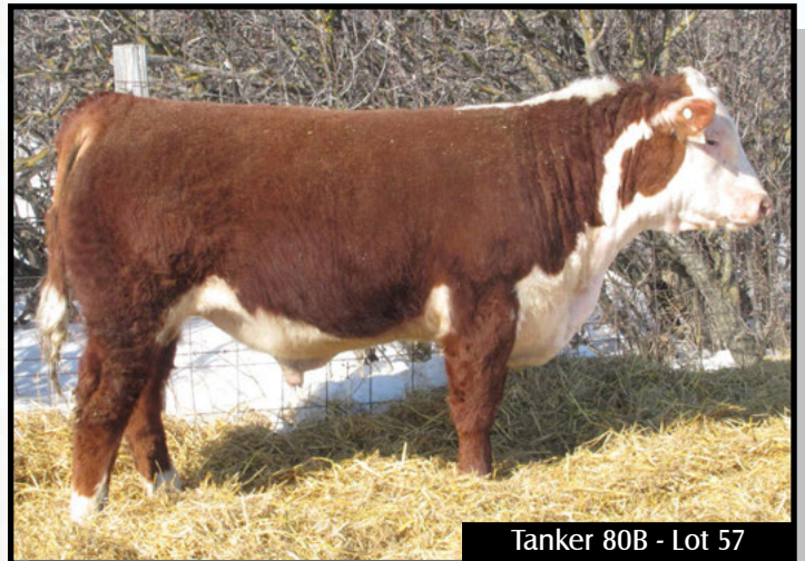
Tanker 80B - Lot 57

Big butted and square made, calving ease throughout pedigree. Good bull with a good future. HEIFER APPROVED.