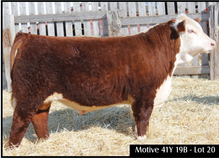
Motive 41Y 19B - Lot 20