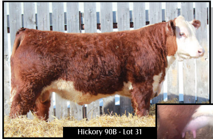
Hickory 90B - Lot 31

First son of junior herd sire Zach 60Z to be offered for sale. Lots of shape and top with calving ease built in. A bull we think a lot of! Born Unassisted. HEIFER APPROVED.