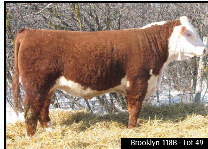
Brooklyn 118B - Lot 49

A favorite around here with a great mother. Long sided and smooth made with calving ease bred into him. A true herd bull in the making. HEIFER APPROVED.