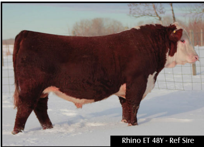
Rhino ET 48Y - Ref Sire

BW: 3.7 WW: 53.0 YW: 92.0 MILK: 20.5 TM: 47.0