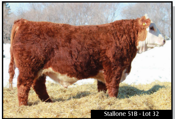
Stallone 51B - Lot 32

Stallone is often picked as our best bull. Red necked with lots of thickness, guts and fleshing ability. Our Hometown sons are all good depending on what you're looking for in a herd sire, everybody will pick a different one. His dam 118S is a hard working never miss cow. Born Unassisted. HEIFER APPROVED. SELLING 3/4 INTEREST AND FULL POSSESSION.