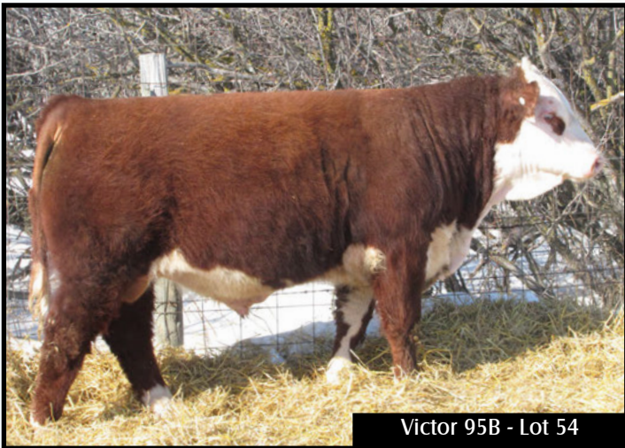
Victor 95B - Lot 54

Calving ease and maternal bred, very well balanced and complete made. Redeem daughters are making great mothers. HEIFER APPROVED.