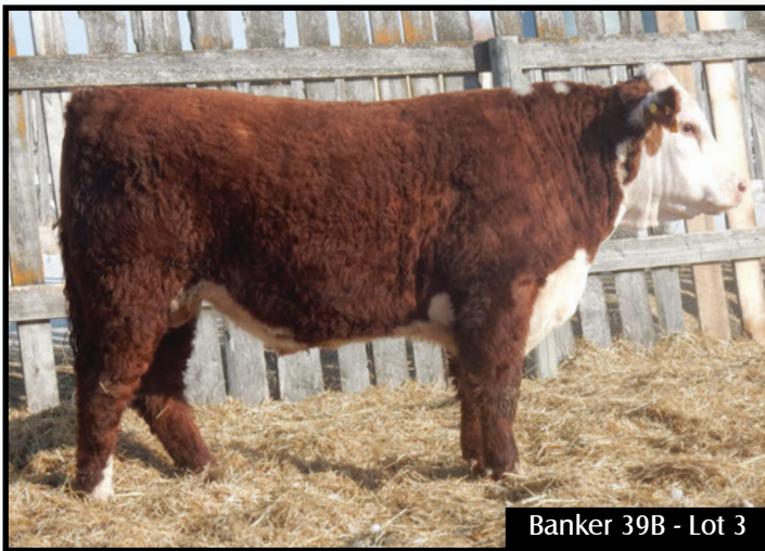
Banker 39B - Lot 3

Brick. Solid. Just like his name says. Wide topped, big butted, deep flanked and easy fleshing. His pedigree is different with the increasingly popular Wyarno on the top. His dam, better known as Patch is a square uddered Nitrogen daughter just coming into her prime. If you want to add pounds Brick is the way to go!