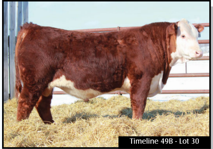
Timeline 49B - Lot 30

Tremendous herd sire prospect sired by Denver Champion, Times A' Wastin. From tremendous length, lots of hip, and shape coming into a spectacular front end. Making this bull even more popular are the good set of numbers he carries. At a later date we may wish to draw semen for our own use. Born Unassisted. HEIFER APPROVED. SELLING 3/4 INTEREST AND FULL POSSESSION.