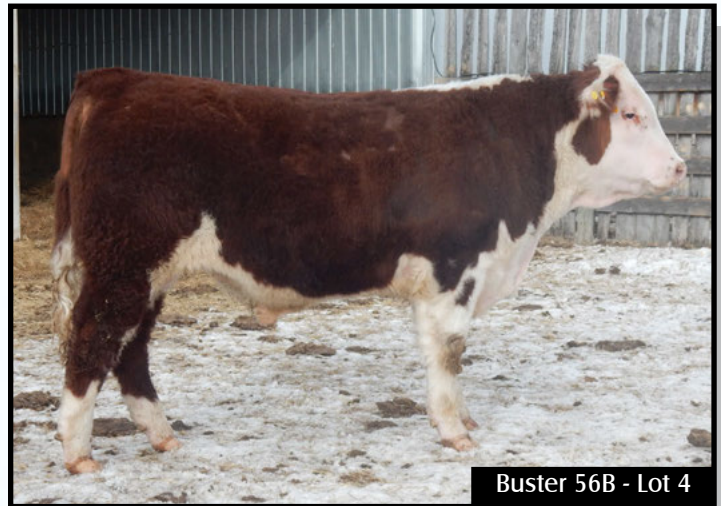
Buster 56B - Lot 4

A bit younger Zappa son and a little more splashed up but he'll be easier to find! For those Cowboys that like them a little more traditional looking. His dam belongs to one of our oldest cow families with some of the best Rafter U breeding in her pedigree. Buster's maternal brother sold to Cam Buyers at Carduff in last year's sale. Buy with confidence.