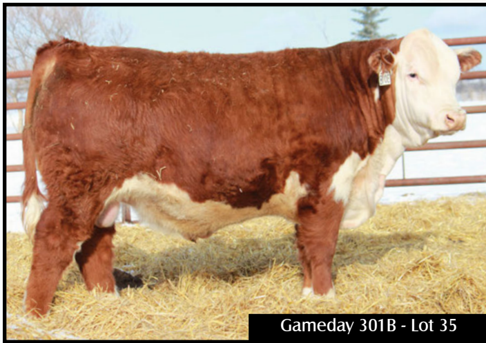
Gameday 301B - Lot 35

Tremendous Classic son out of a Heater three year old. This guy is good from any angle. Length, muscle, tremendous hip and as sound as can be. A bull that will get out and breed for a long time. 77Y's first calf sold to Lyle Cowan of Gainsborough for $5000 in our fall sale. Same cow family as 100B (Lot 33) Born Unassisted.