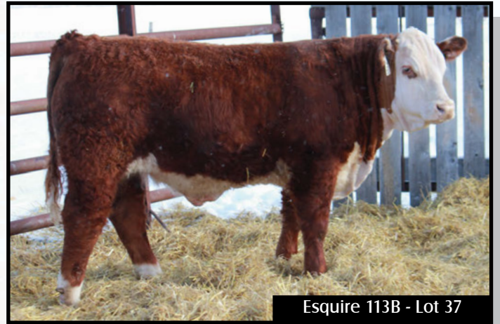
Esquire 113B - Lot 37

Esquire 113B is very correct. He could sire some great show steers. Clean fronted, lots of depth and spring of rib. Lots of hip and standing squarely on all four corners. Would like to see this guy on a bunch of black cows. Born Unassisted.