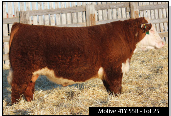
Motive 41Y 55B - Lot 25

There is a lot to appreciate when you analyze this calf. This bull is very stout with a huge top. He is an easy doing individual with volume and capacity. His mom is a beautiful uddered, heavy milking female who is now in our flush program. Don't over look this guy; he is just the end of March.