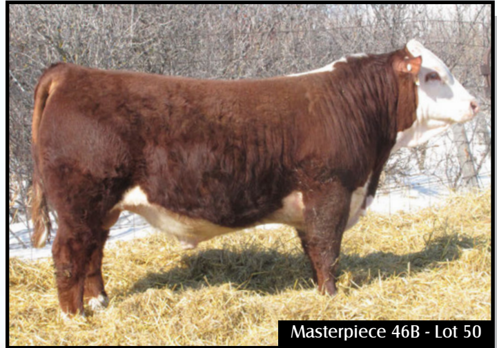
Masterpiece 46B - Lot 50

Fully pigmented, really deep sided and loose made. A powerful, thick and sound bull.