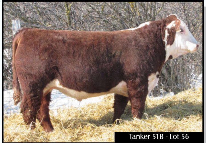
Tanker 51B - Lot 56

Highly maternal pedigree and calving ease. Correct in his make-up. HEIFER APPROVED.