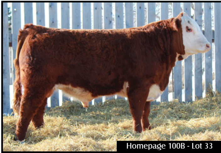
Homepage 100B - Lot 33