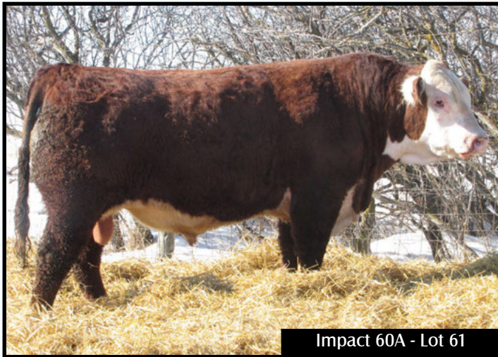
Impact 60A - Lot 61

Easy doing and stout made, calving ease; used here on some heifers. He was kept back to sell as a two year old.