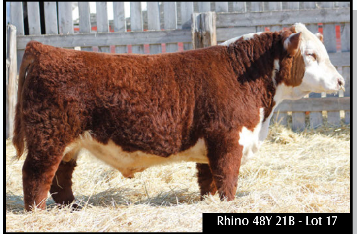
Rhino 48Y 21B - Lot 17

This Rhino was another member of our show team. He is a moderate framed bull that has a nice look about him. Where you really start to appreciate this calf is when you get behind him, he has a tremendous hip on him with an explosive stifle. His mother is a great uddered, heavy milking P606 daughter.