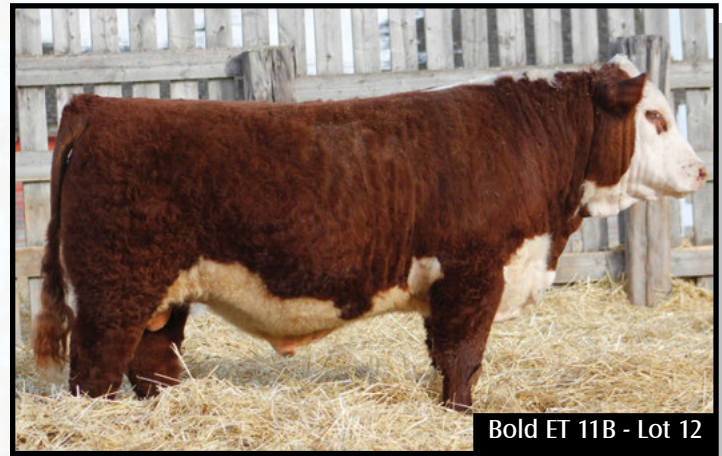
Bold ET 11B - Lot 12