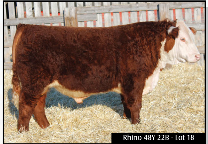
Rhino 48Y 22B - Lot 18

Here is a bull you really have to appreciate from all angles. He is a big bodied, wide based, stout made individual. You have to admire the fleshing ability and the hair coat on this bull. Definitely will add some value to any program.