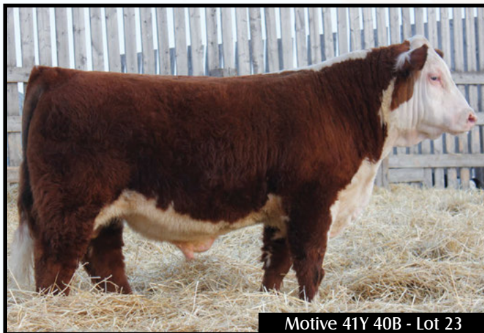
Motive 41Y 40B - Lot 23