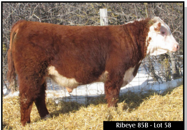
Ribeye 85B - Lot 58

Tremendous bull here, lots of muscle with a great look to him. A lot of great cows in his pedigree. 88X genetics are rare in Canada.