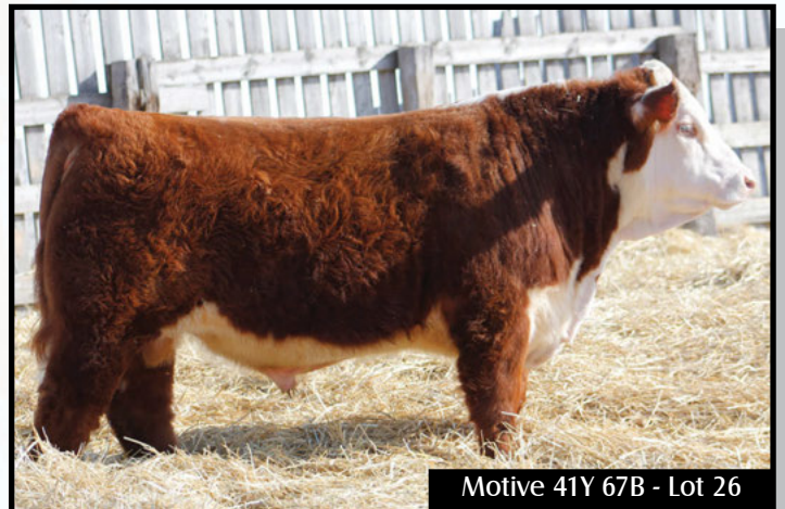
Motive 41Y 67B - Lot 26

Our youngest bull in the offering but may have the highest WDA. This bull is big boned and very powerful. A real performance sire here.