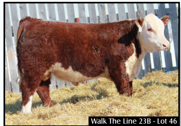
Walk The Line 23B - Lot 46