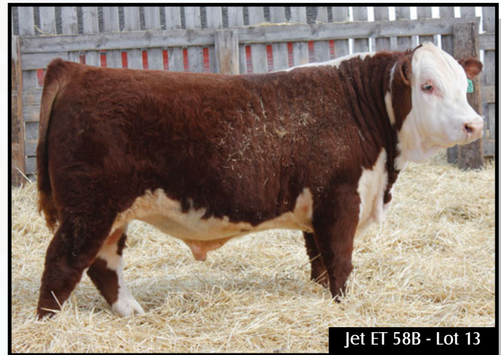
Jet ET 58B - Lot 13

This is the youngest of the Mira flush calves. You really have to appreciate the skull structure and character this young calf possesses. He is stout made and big bodied. His mom will go down as one of the all time greats.