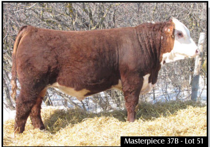
Masterpiece 37B - Lot 51

Fully pigmented, stout and rugged herd bull in the making. Maternal brother was high seller last year for us selling to Manchester Polled Herefords.