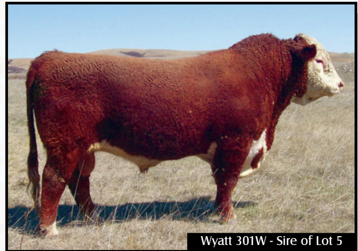
Wyatt 301W - Sire of Lot 5

Beau is the youngest bull in our offering and the only Wyatt son to sell. He may be an April calf but he exhibits all the desired qualities of a calf 3 or 4 months older. He is larger framed and long spined with great feet like his old man, who is still covering a large pasture at Kurt's. His yearling EPD shows that exceptional growth rate. If you are looking to frame up your cow herd and add those extra pounds with the extra length then don't overlook Beau.