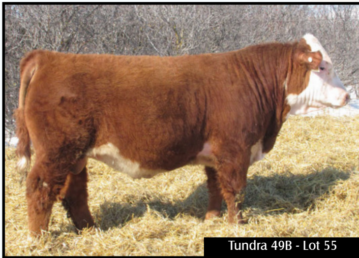
Tundra 49B - Lot 55

Red eyed, with lots of growth and performance. Great cow family.