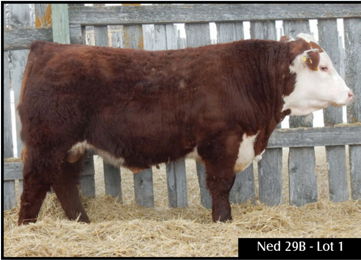
Ned 29B - Lot 1