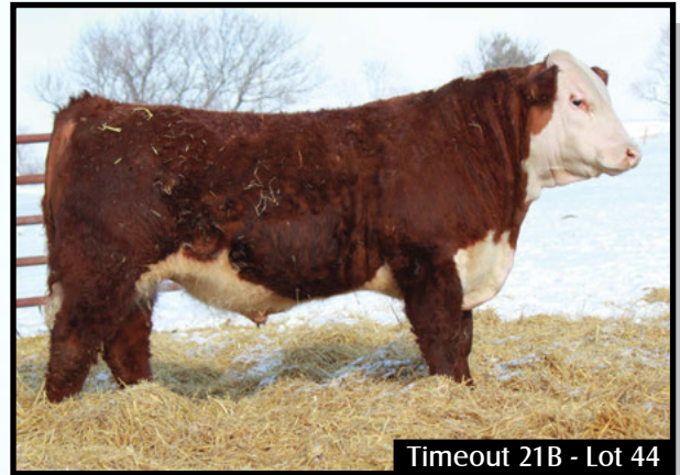
Timeout 21B - Lot 44

One of three sons of overall National Western Champion Bull, Times A' Wastin. Timeout is straight in his line with balance and style. 100% pigment. Tremendous dam. HEIFER APPROVED. Born Unassisted.