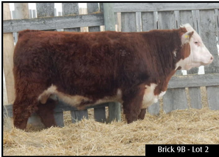
Brick 9B - Lot 2