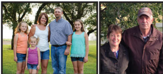
Glenlees Polled Herefords