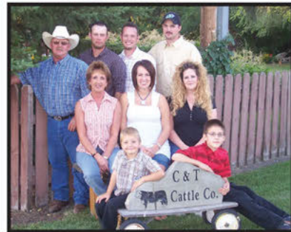
C&T Cattle Co.