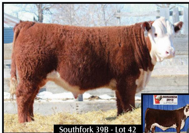
Southfork 39B - Lot 42