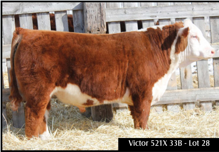
Victor 521X 33B - Lot 28

This son of the National Champion Trust is short marked with added pigment. His mother is a perfect uddered Umpire daughter with excellent flow of milk. He is long sided and very sound structured.