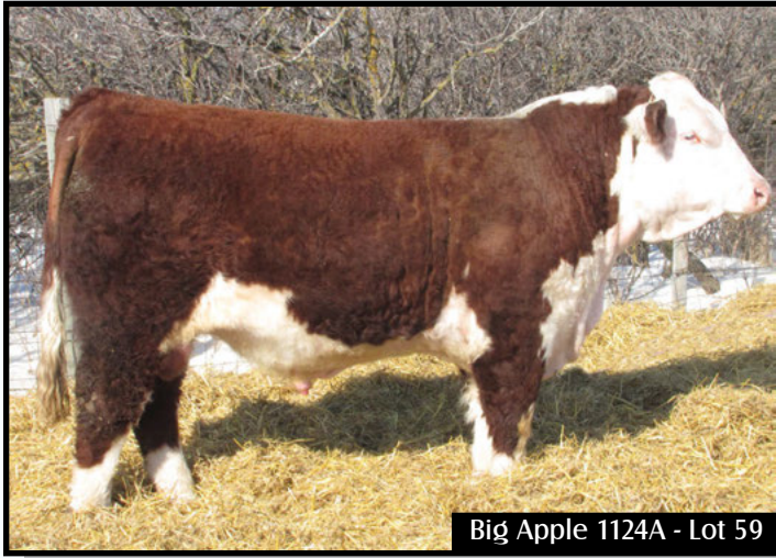
Big Apple 1124A - Lot 59

59 SNBR-GL NY THE Big Apple 1124A DLF IEF HYF PC02993518 SNBR 1124A NOV. 24, 2013 POLLED