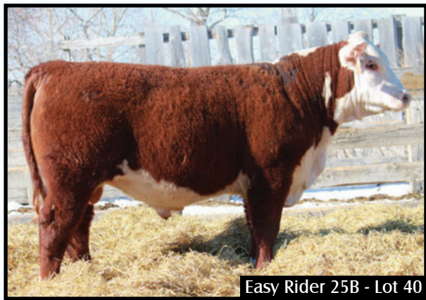
Easy Rider 25B - Lot 40

Manhattan 82B is an embryo out of the great breeding 33P from Haroldsons. Very correct and attractive to the eye. His full sister 59A had a very successful show career, winning her class at CWA in three different shows. As well 59A calved today, February 24, with a perfect udder and a nice heifer calf. Born Unassisted. HEIFER APPROVED.