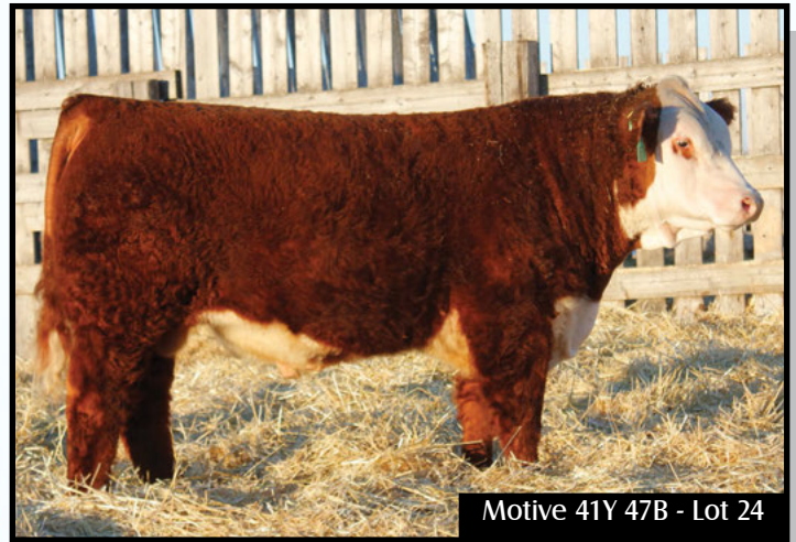
Motive 41Y 47B - Lot 24

This Motive son is real long sided with a nice look. He is a stout made, wide based individual. Remember length equals pounds.