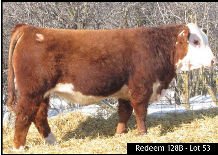
Redeem 128B - Lot 53