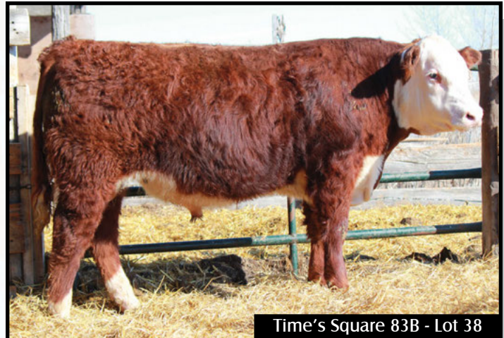
Time's Square 83B - Lot 38

Another Times A' Wastin out of a great cow family. Lots of muscle, style and pigment, standing on a great set of feet and legs. Bred to calve easy and sire females with milk flow and flawless udders. Born Unassisted. HEIFER APPROVED.