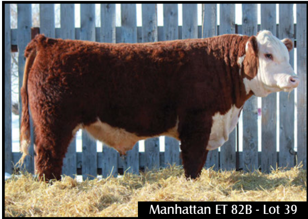
Manhattan ET 82B - Lot 39