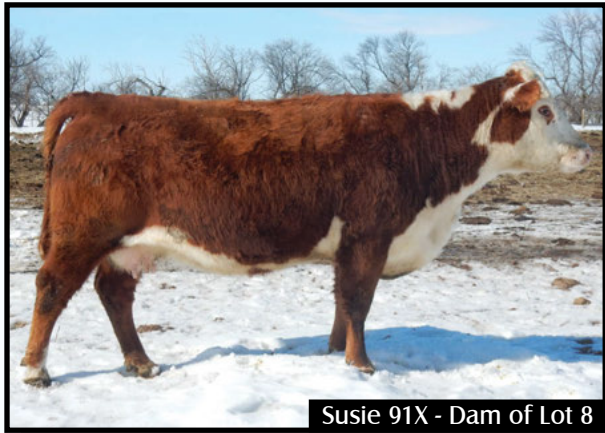
Susie 91X - Dam of Lot 8