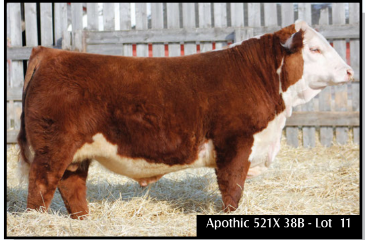
Apothic 521X 38B - Lot 11

Apothic is a bull that we are very high on here. He is a wide based bull with extra muscle and shape. He is a big quartered bull with that extra pop to his stifle. He is a big ribbed and bold sprung with a great herd bull look. Our Anchor daughter's are no nonsense cows- they are excellent mothers with good udders and lots of milk. Apothic was Junior Bull Calf Champion at Agribition. TERMS TO BE ANNOUNCED.