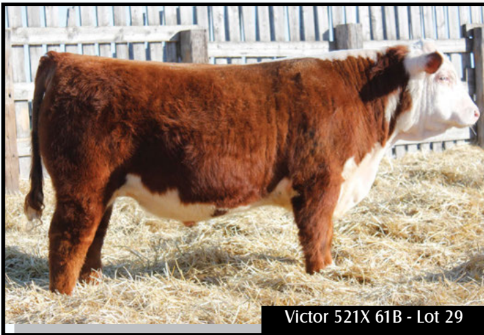
Victor 521X 61B - Lot 29

Victor 33B is a bull that has a lot of future to him. He is a smooth made bull who is very nice bodied and clean jointed, yet still has that muscle shape and power to him. He has a lot of spring of rib and shape to his body. His mom is a very productive young Tahoe daughter. Be sure to study this guy. HEIFER APPROVED.