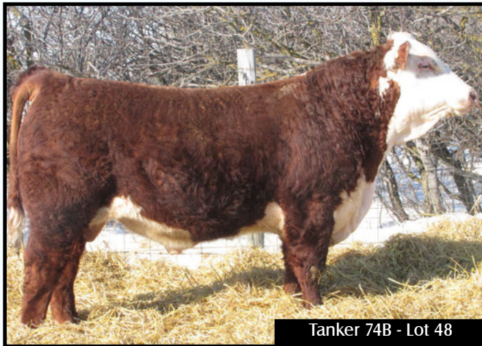
Tanker 74B - Lot 48

Tremendous individual and massive in his shape. Reigning Senior Bull Calf Champion at Agribition and Bull Calf Champion at Bonanza in Ontario. Moderate birth weight and a nice set of numbers. Herd bull here.