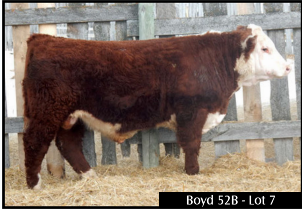
Boyd 52B - Lot 7