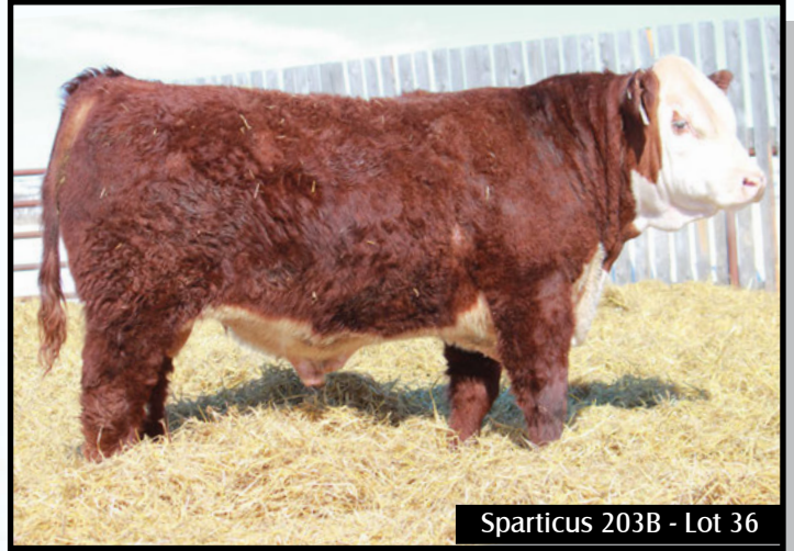
Sparticus 203B - Lot 36

Lots of guts and easy fleshing in this Untapped son Bob purchased in dam from the Meadow Acres Dispersal. Dark red with one big goggled eye. His dam is a real power cow with a nice udder. Born Unassisted. HEIFER APPROVED.