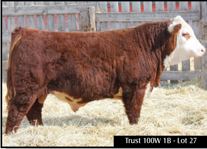
Trust 100W 1B - Lot 27