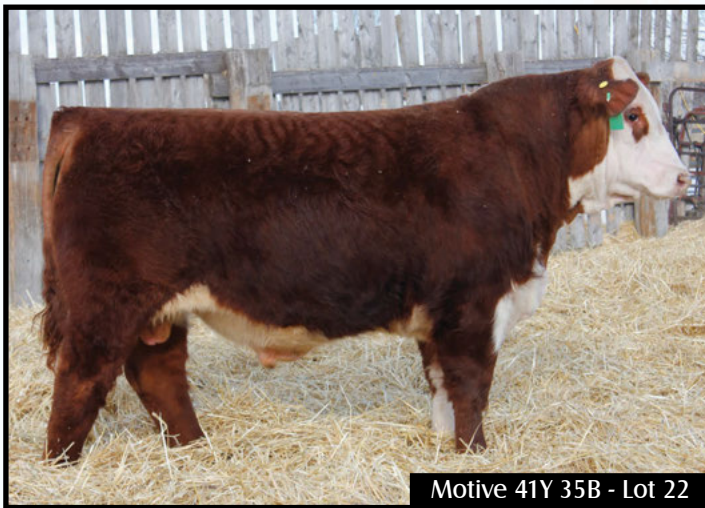
Motive 41Y 35B - Lot 22

We feel this is a very high quality individual. He is a big middle, stout made bull who is very sound structured and athletic in his movement. His mother has been very productive and has another top bull calf this year.