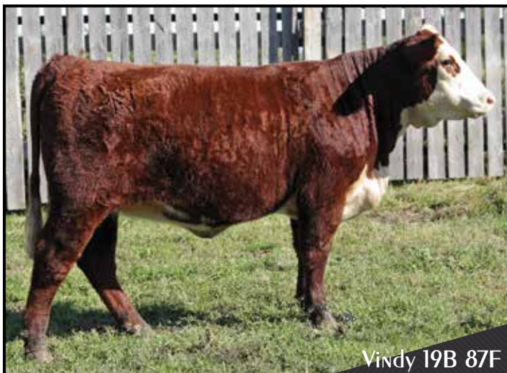
Vindy 19B 87F

AI bred to Boyd 31Z Blueprint 6153 on May 23, 2019. Pasture exposed to DTHF Dalton 191D from June 10 to August 10, 2019.