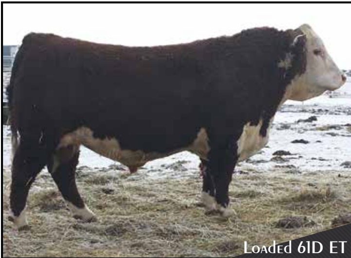
Loaded 61D ET