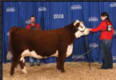
Haroldson's Marvel ET 47E 2018 Agribition Class Winner