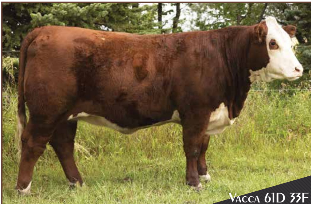
VACCA 61D 33F

33F, along with her mother 11D was Reserve Champion Female at Manitoba Livestock Expo last fall. Not only has she the cosmetics, depth and thickness to do well in the show ring but also the genetics to make a top brood cow. The Loaded 61D ET daughters as a group look awesome and we are excited to calve them out next spring. Her mother 11D has been put into our donor program.