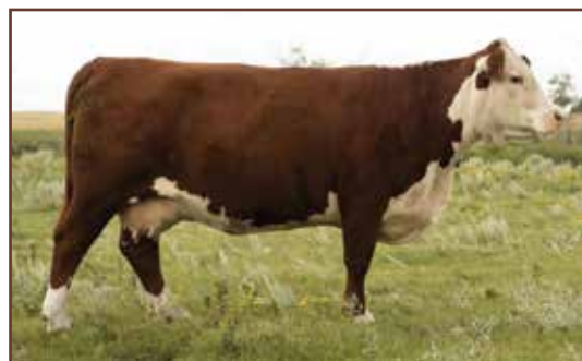
Dam: Roselawn Piper 154U 25B