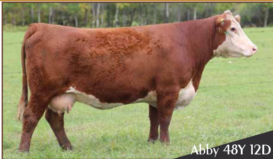
Abby 48Y 12D

Here is a real nice daughter of the female maker, Rhino. Abby is a very attractive female with tremendous milk flow. This is a very high quality pair. Pasture exposed to H FHF Pilgrim 8441 ET from May 25 to July 15, 2019.