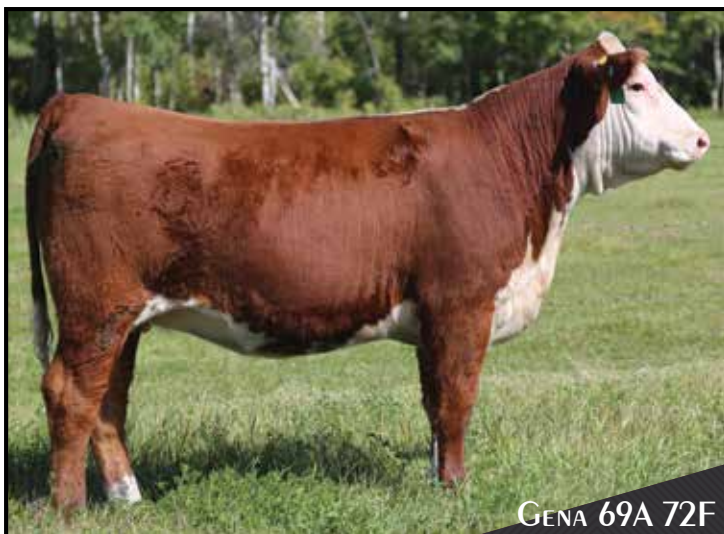
GENA 69A 72F

AL bred to Haroldson's Totem ET 49F on May 22 and exposed to him until August 15, 2019.