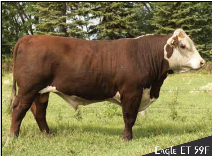
Eagle ET 59F