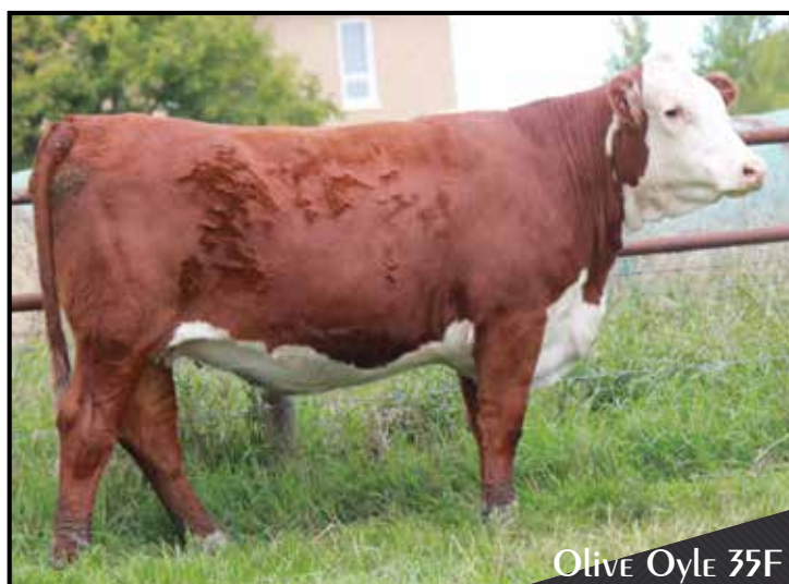
OLIVE OYLE 35F

Olive Oyle 35F is a female we think very highly of. Extra growth, length and capacity. Her cow family from Heidi 85H is immaculate. Warrior will lower birth weight and we feel confident in their maternal productivity. An interesting service! Cannon was a feature bull in our spring bull sale, selling to Bar Star in Montana. AI bred to RU BA 27C Cannon 218F on April 15, 2019. Due to calve January 24, 2020.