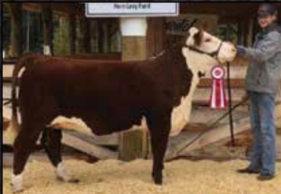
Blair-Athol 43C Diamond 122F 2019 Champion Jackpot Heifer at Burns Lake and Vanderhoof Fall Fairs for Weston Warkentin, BC