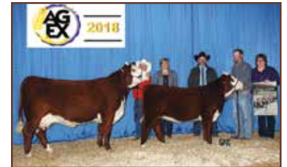
Dam: Roselawn Aywon Joy 113B 11D 2018 Manitoba Ag Ex Reserve Champion Hereford Female