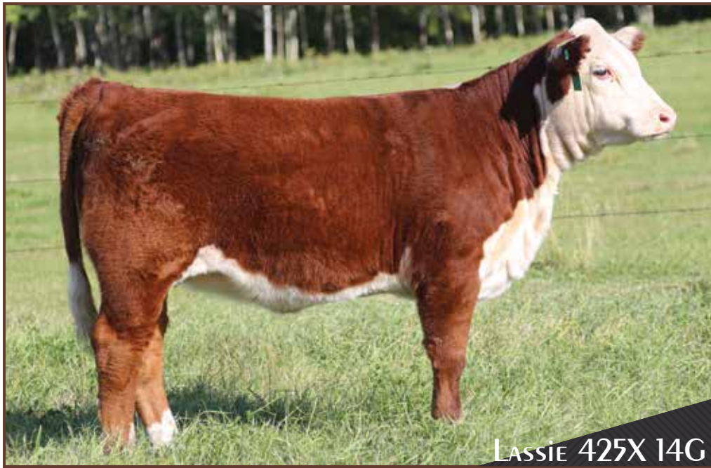
LASSIE 425X 14G

This direct Untapped daughter is super complete made with that wicked hair coat. I love the shape, style and presence this one has.