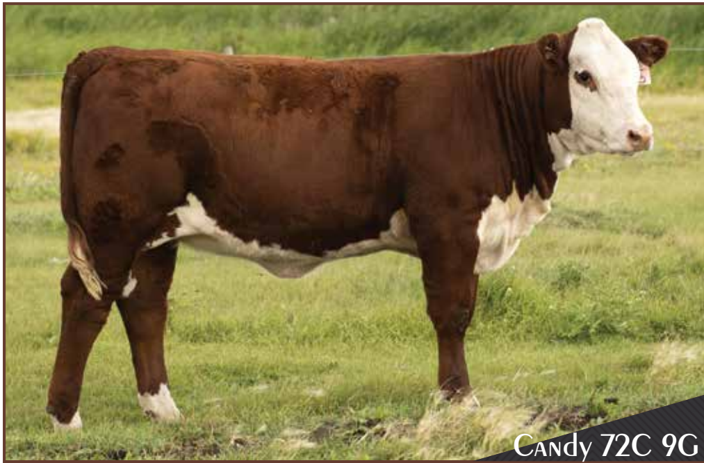
CANDY 72C 9G