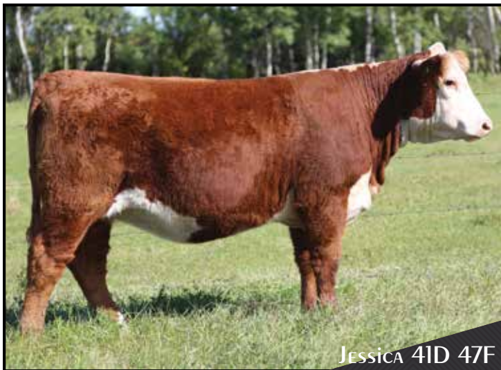
Jessica 41D 47F

Pasture exposed to Haroldson's Totem ET 49F from June 1 to August 15, 2019.