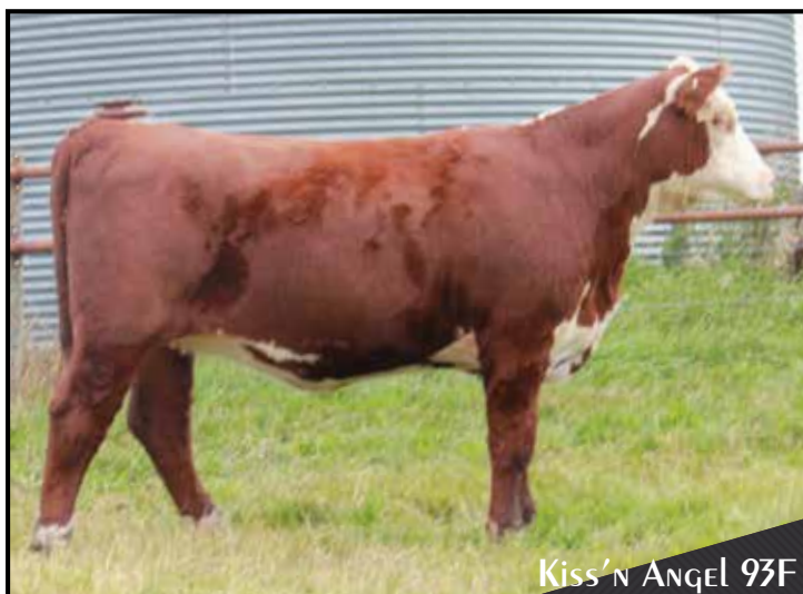
Kiss'n Angel 93F

Lots of growth in this Ace daughter. The Kisses family is consistent in udder quality and calving ease. Pasture exposed to NJW 103Y 174X Diablo 156C ET from May 18 to August 10, 2019. Ultrasound indicates March 1, 2020 heifer calf.