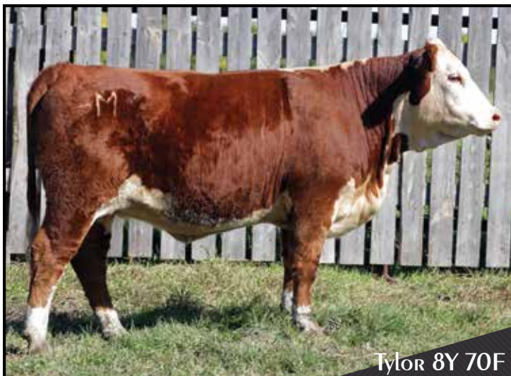
Tylor 8Y 70F

AI bred to Boyd 31Z Blueprint 6153 on May 23, 2019. Pasture exposed to DTHF Dalton 191D from June 10 to August 10, 2019.