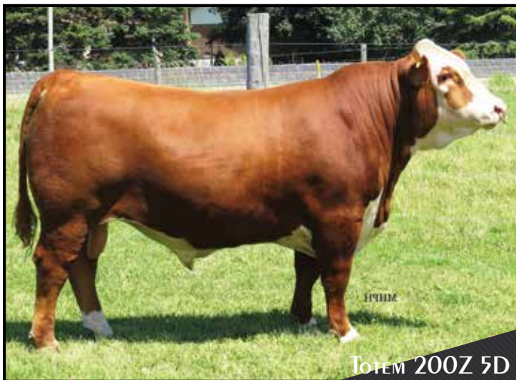
Totem 200Z 5D