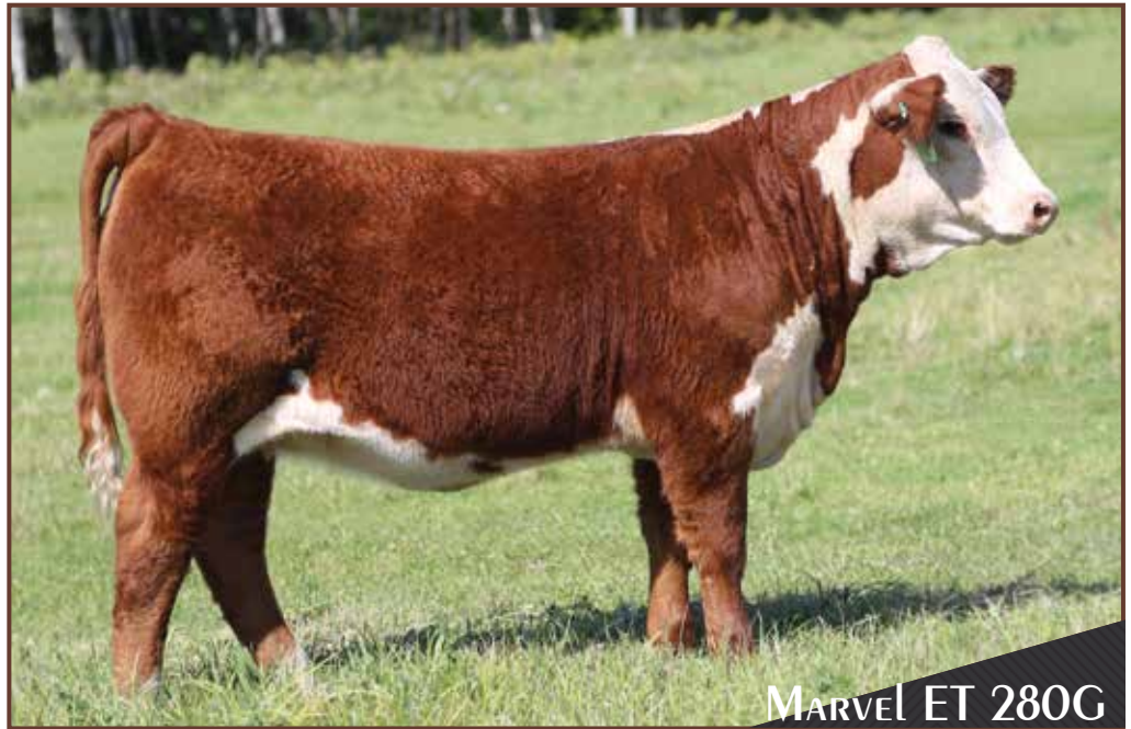
MARVEL ET 280G

Marvel 280G is one that is extremely hard to part with. This heifer has it all. She is huge middled with tremendous turn to her rib. She is a very stout made heifer that gets out and travels with ease. Her mother, Marvel 12B, has proven to be one of the potent donors in the breed, producing many sale toppers at her young age. A definite sale feature.