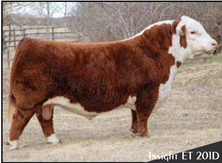
Insight ET 201D