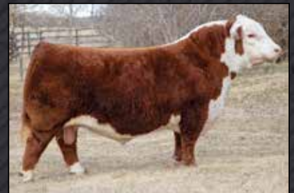
Haroldson's Insight ET 201D 2018 Agribition Reserve National Champion Bull Owned with Arthur Polled Herefords