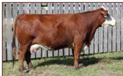
Dam: Manns Dawn 46Z 55B

We would like to keep show rights until after Ag Ex in Brandon, if the new buyer is in agreement.