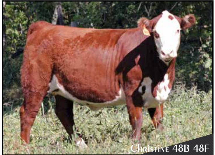
CHRISTINE 48B 48F

AI bred to to Boyd 31Z Blueprint 6153 on May 23, 2019. Pasture exposed to DTHF Dalton 191D from June 10 to August 10, 2019.