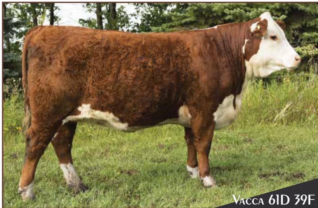
VACCA 61D 39F