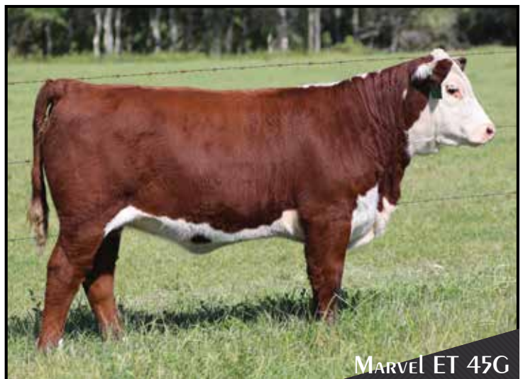
MARVEL ET 45G

This one has cow power written all over her. She is a high volumed heifer with that extra shape to her rib cage. Great cosmetics in a very sound package.