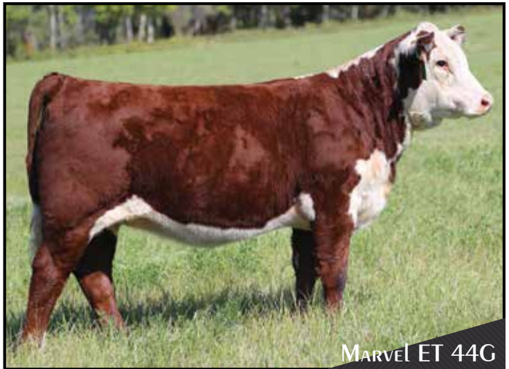
MARVEL ET 44G