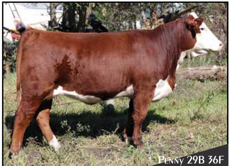
PENNY 29B 36F

AI bred to McCoy 2426 Legacy 9F on May 18, 2019. Pasture exposed to Til-Toba Elvis 11E from June 10 to August 10, 2019.