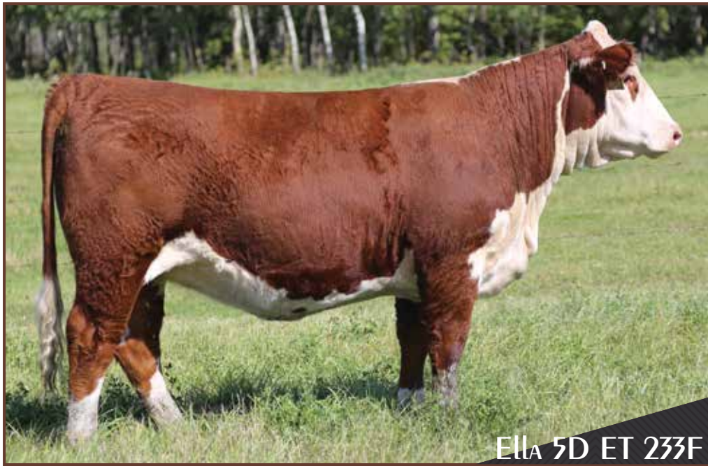
ELLA 5D ET 233F

I really like this Totem daughter. She is extremely long sided and attractive through that front end. When she gets into motion you appreciate her effortless movement.