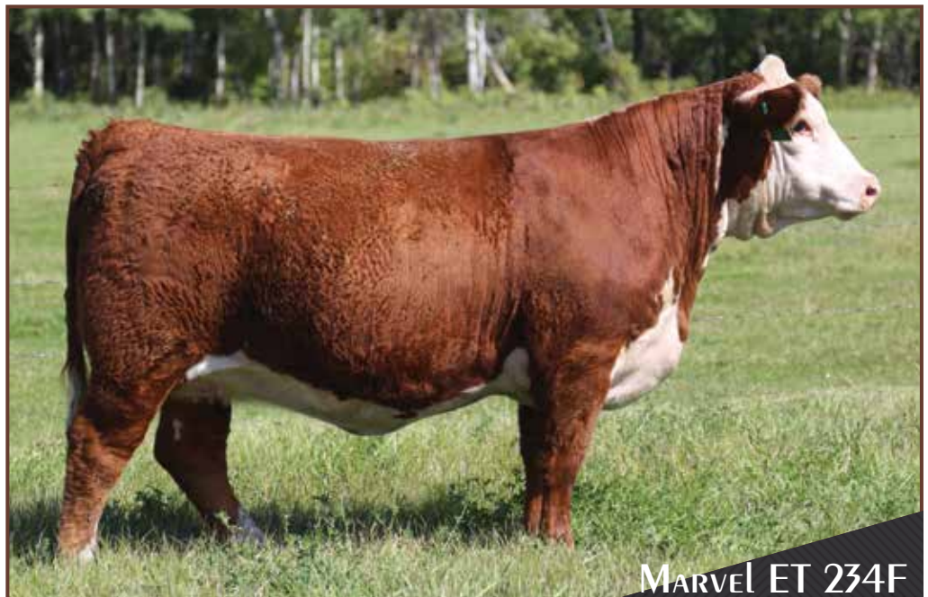
MARVEL ET 234F

AI bred to Haroldson's Insight ET 201D on April 30, 2019. Pasture exposed to Haroldson's Red Zone ET 41D from June 10 to August 15, 2019.