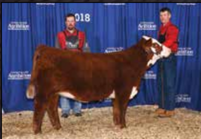
Haroldson's LH Cabernet 13F 2018 Agribition Class Winner Owned by Medonte Highlands Polled Herefords