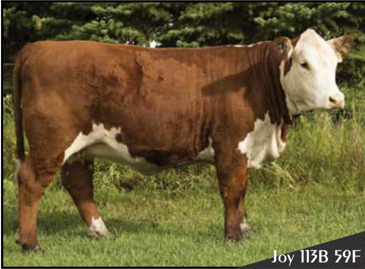
Joy 113B 59F