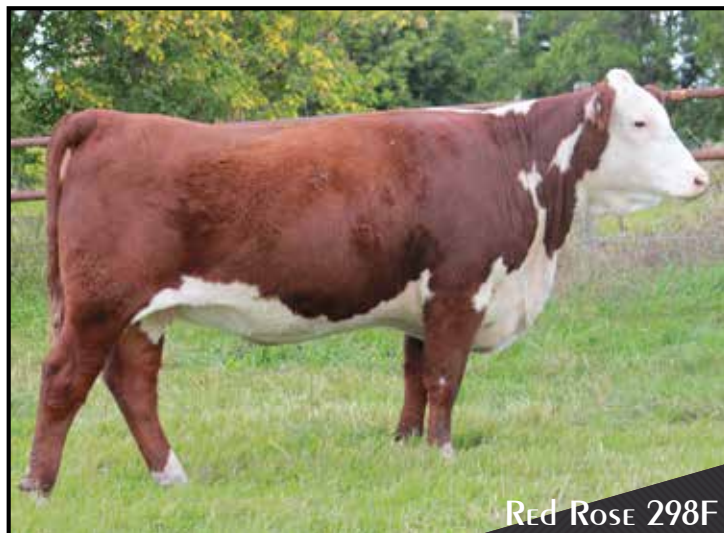
Red ROSE 298F

Pasture exposed to McCoy 53A Patent 124E from June 22 to August 11, 2019. Observed bred July 5, 2019. Due to calve April 15, 2020. Owned with Robert Bestrop.