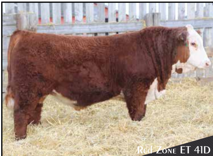
Red Zone ET 41D