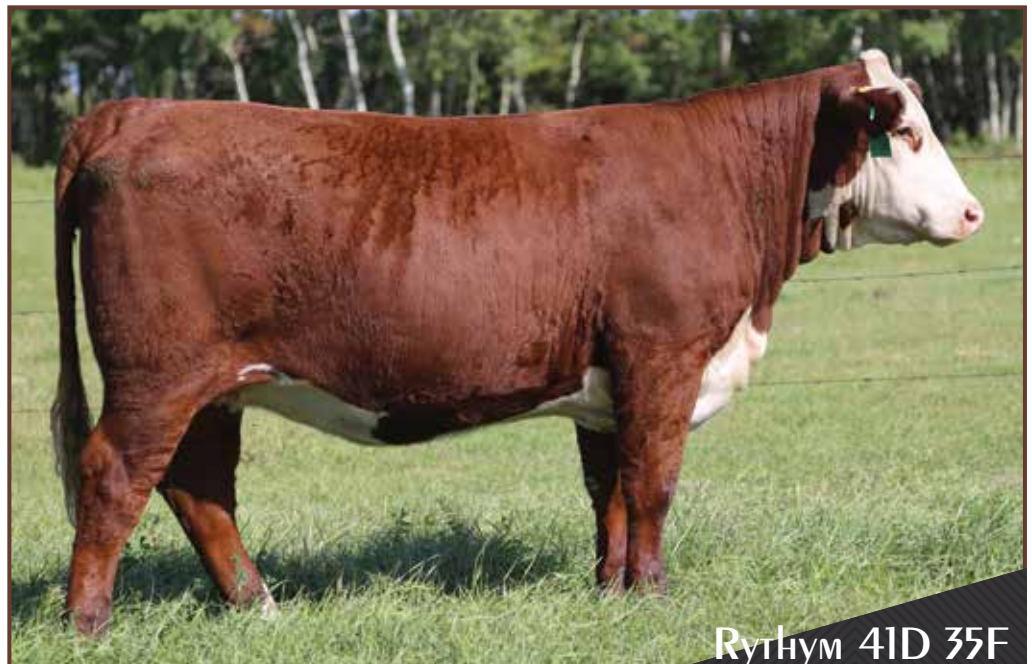
Rythm 41D 35F

AI bred to Haroldson's Insight ET 201D on May 30, 2019. Pasture exposed to Haroldson's Totem ET 49F from June 22 to August 15, 2019.