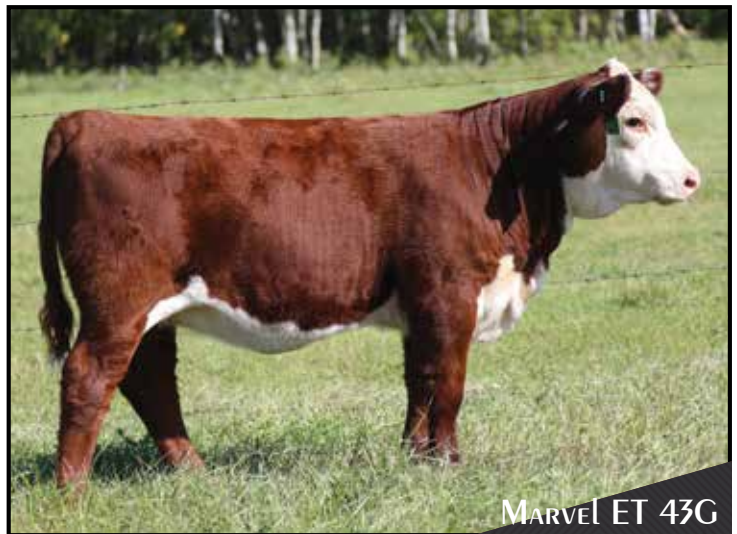
MARVEL ET 43G

She's got the look. Long fronted, clean chested with added presence. Certainly enough mass and power in this female when viewed from all angles. Will be a big time donor after she is done wearing the leather.