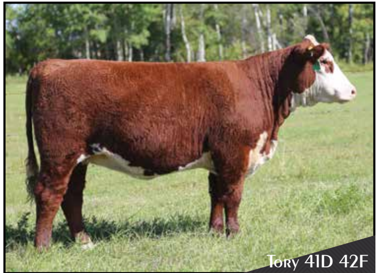
Tory 41D 42F

Pasture exposed to Haroldson's Totem ET 49F from June 1 to August 15, 2019.