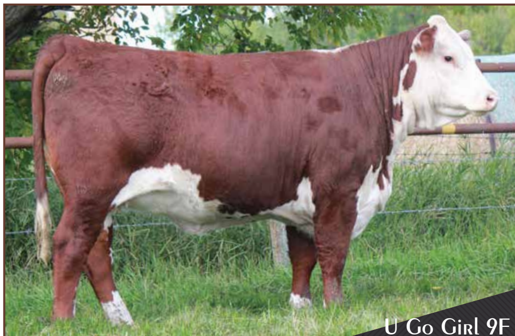
U Go Girl 9F