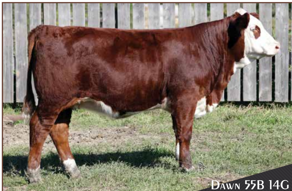
DAWN 55B 14G