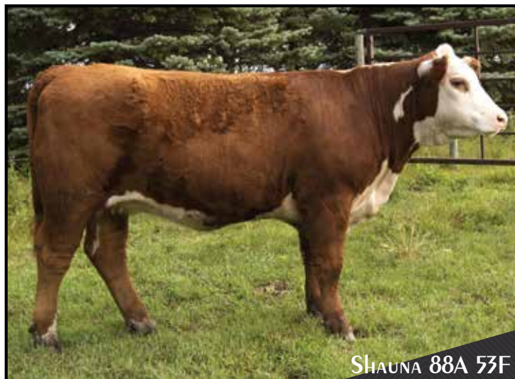
SHAUNA 88A 53F

Another good Inspector out of a Golden-Oak Maximum daughter. Nice uddered, eye catching, brood cow here. Every Inspector daughter has turned into a good productive cow. Pasture exposed to NJW Loaded 61D ET from May 9 to August 1, 2019. Preg checked safe for a late March calf.