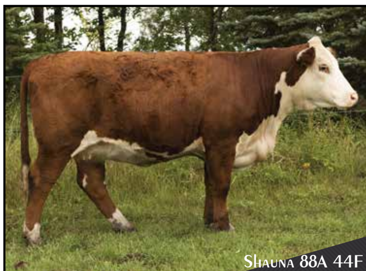
SHAUNA 88A 44F

Here is a sharp looking, Inspector daughter that will catch your eye. Good udders in this cow family. Pasture exposed to NJW Loaded 61D ET from May 9 to August 1, 2019. Observed bred May 9. Preg checked safe for a February 17, 2020 calf.