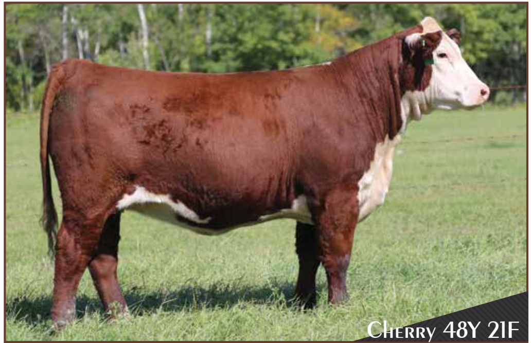
Cherry 48Y 21F

AI bred to Haroldson's Totem 200Z 5D on May 31, 2019. Pasture exposed to Haroldson's Totem ET 49F from June 22 to August 15.