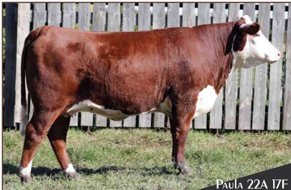
PAULA 22A 17F

AI bred to Boyd 31Z Blueprint 6153 on May 23, 2019. Pasture exposed to Til-Toba Elvis 11E from June 10 to August 10, 2019.