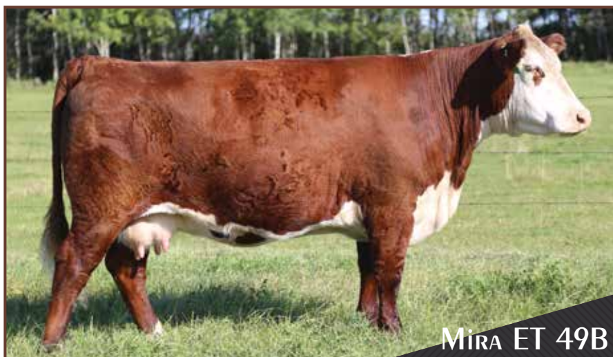
MIRA ET 49B

Mira 1G is a real long sided, nice fronted female with that cosmetic package that will get one noticed. Her mother is a gorgeous uddered Mira 62K daughter. Be sure to study this one.