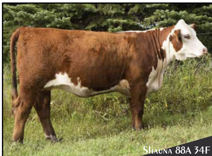
SHAUNA 88A 34F

Pasture exposed to NJW Loaded 61D ET from May 9 to August 10, 2109. Preg checked for a late February calf.