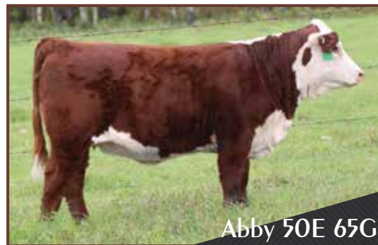
Abby 50E 65G

Here is a real nice daughter of the female maker, Rhino. Abby is a very attractive female with tremendous milk flow. This is a very high quality pair. Pasture exposed to H FHF Pilgrim 8441 ET from May 25 to July 15, 2019.