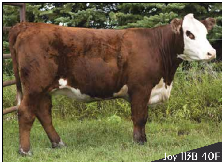
Joy 113B 40F

If you're looking for a heifer with a lot of length, here she is! Her mother is a good Walk Hard daughter. Pasture exposed to NJW Loaded 61D ET from May 9 to August 1, 2019. Preg checked to calve late March.