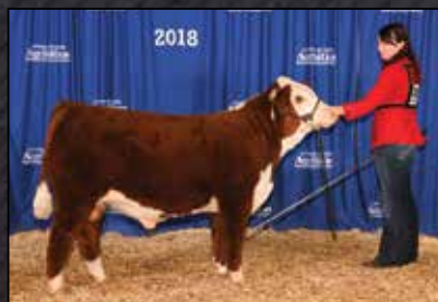
Haroldson's Hiker ET 45F 2018 Agribition Class Winner Owned with WLC