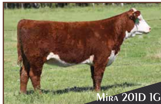
MIRA 201D 1G

Here's an opportunity to acquire a direct daughter of a breed icon, Mira 62K. This Masterpiece female is very high quality in terms of her look, pedigree and her cosmetics. She is a big bodied, complete made female with a terrific udder and great milk flow. Sells open and ready to flush. Contact for details.