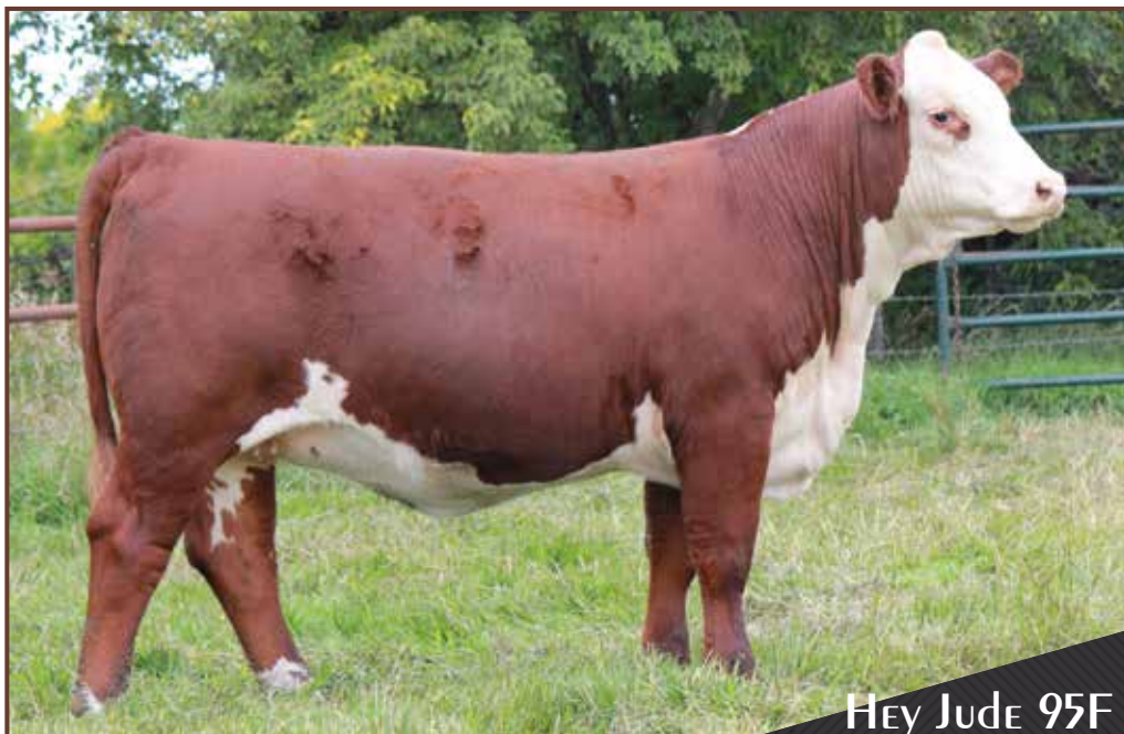
HEY JUDE 95F

Very popular Plainsman daughter. Dark coloured, red eyed with lots of substance. She has the look! Same cow family that produced the great Necklace cow at Maple Hill in Quebec. Pasture exposed to Blair-Athol 10Y Homerun 24C from May 26 to August 6, 2019. Due to calve mid-March, 2020.