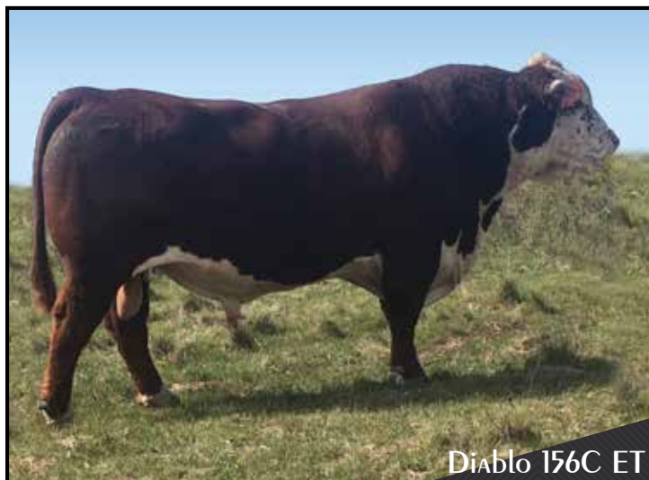
Diablo 156C ET

8 Services and 6 Daughters Sell. Owned with Glenlees Polled Herefords.