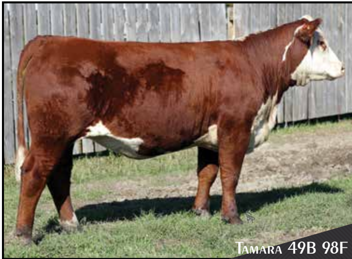
TAMARA 49B 98F