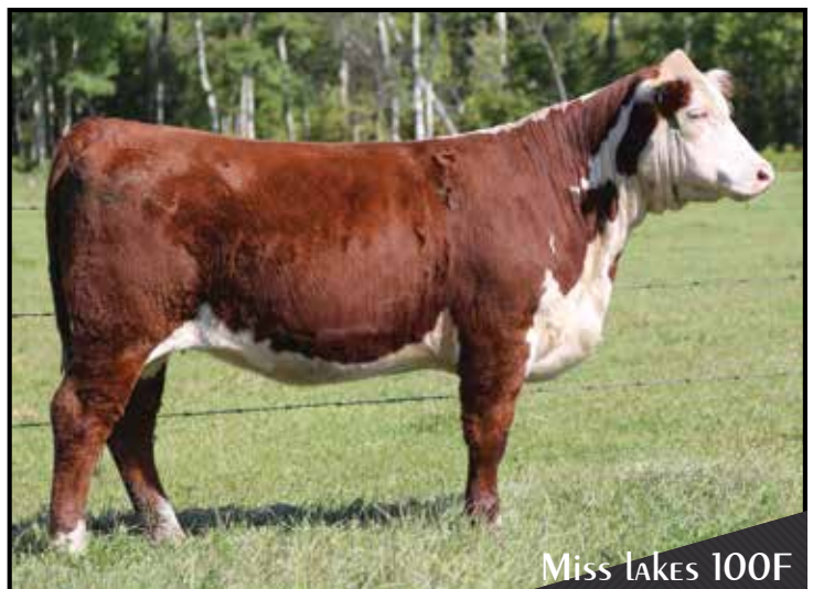
Miss Lakes 100F

Pasture exposed to Haroldson's Totem ET 49F from June 1 to August 15, 2019.