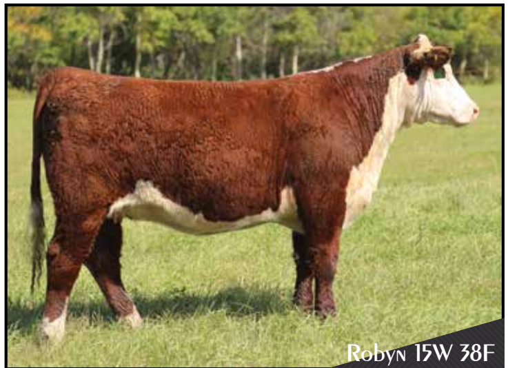
Robyn 15W 38F

AI bred to Haroldson's Insight ET 201D on April 28, 2019. Pasture exposed to Haroldson's Red Zone ET 41D from June 10 to August 15, 2019.